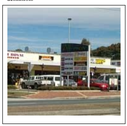
Image 49 - Unacceptable. Inadequate landscape between road and car park.