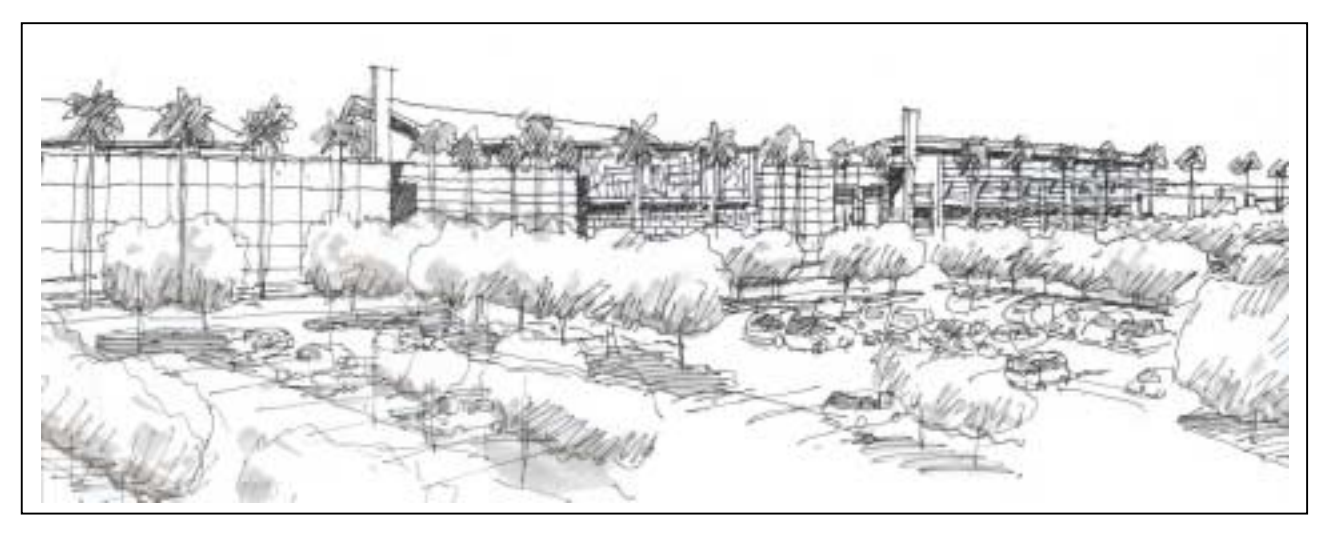
Image 51 - Unacceptable. Landscape screening around the sector perimeter must ensure that the car park areas are significantly screened form a driver's eye and take into account limited viewing opportunities to the buildings.