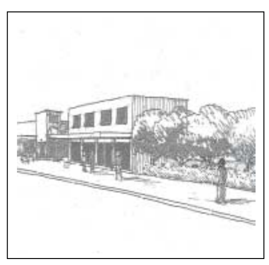
Image 48 - Acceptable. Establish a strong landscape built edge wherea car park abuts North Lakes Drive until built form is constructed.