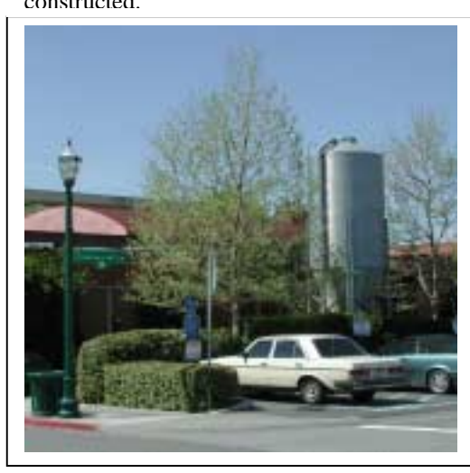
Image 50 - Acceptable . Attractive landscaped edge to car park including variations in height and type of planting edge.