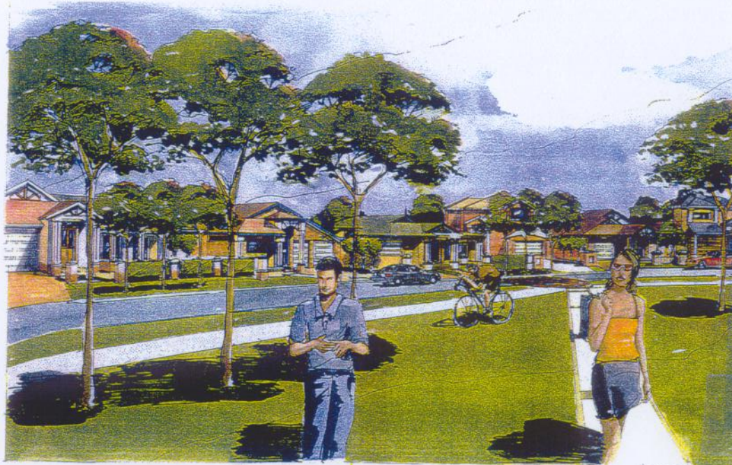
VILLA AND COURTYARD HOUSING FRONTING A LOCAL PARK