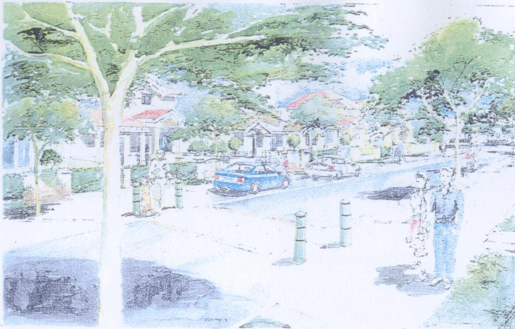
REAR LANE HOUSING FRONTING VILLAGE PARK