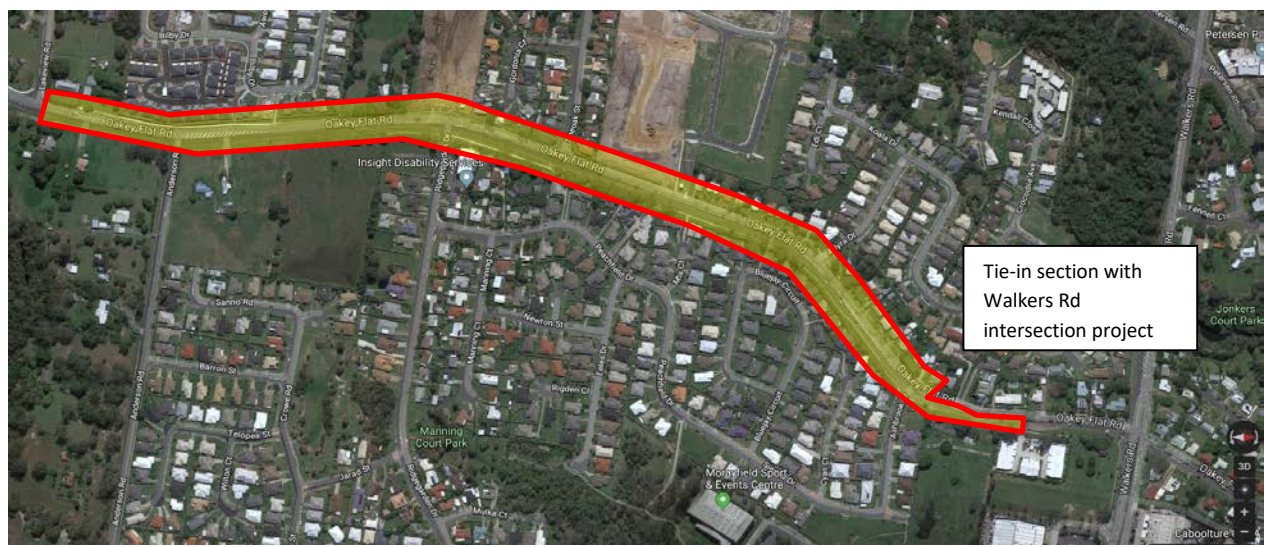
Figure 1 - Project Locality Plan

The broader road construction project commenced on 7 December 2020 and is expected to take approximately 27 weeks to complete, including three weeks allowance for wet weather. The NBN works will be completed under the supervision of the principal project contractor.