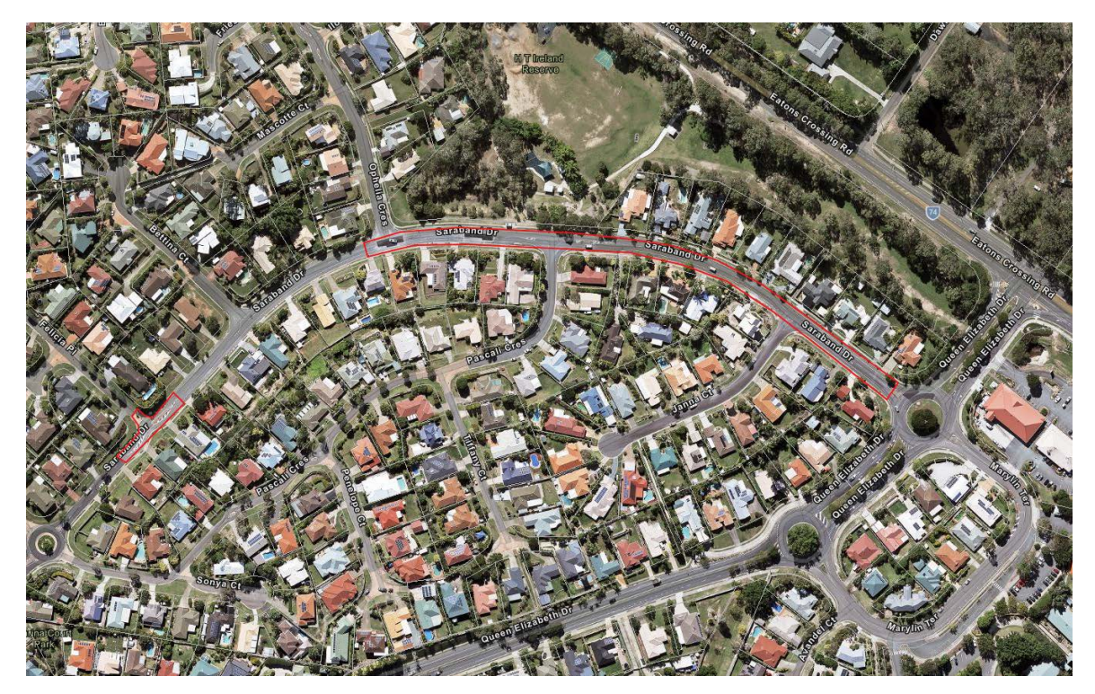
Figure 1: Locality plan

The project is located on Saraband Drive and extends from 51 Saraband Drive to Queen Elizabeth Drive, Eatons Hill. The project scope includes the rehabilitation of the subject section of road over a length of 550m. The existing pavement is currently showing significant signs of stripping, rutting, pavement failures and cracking. The project objective is to renew the pavement and achieve the required level of service. The works will commence in late August / early September 2019 and take nine weeks to complete which includes an allowance for wet weather.