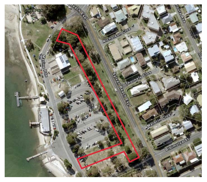
Figure 1: Location of works

Project construction is programmed to commence in mid-August 2019 and conclude in early to mid-September (4 weeks including an allowance for wet weather). Works have been programmed outside of school holidays.