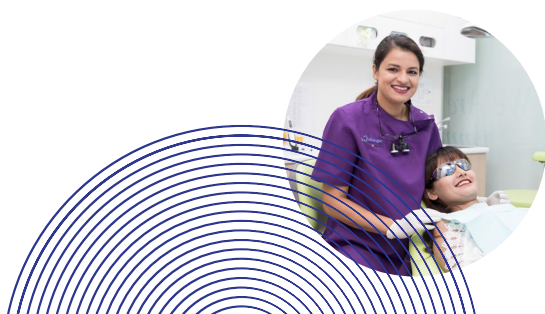
Kallangur Dental Surgery