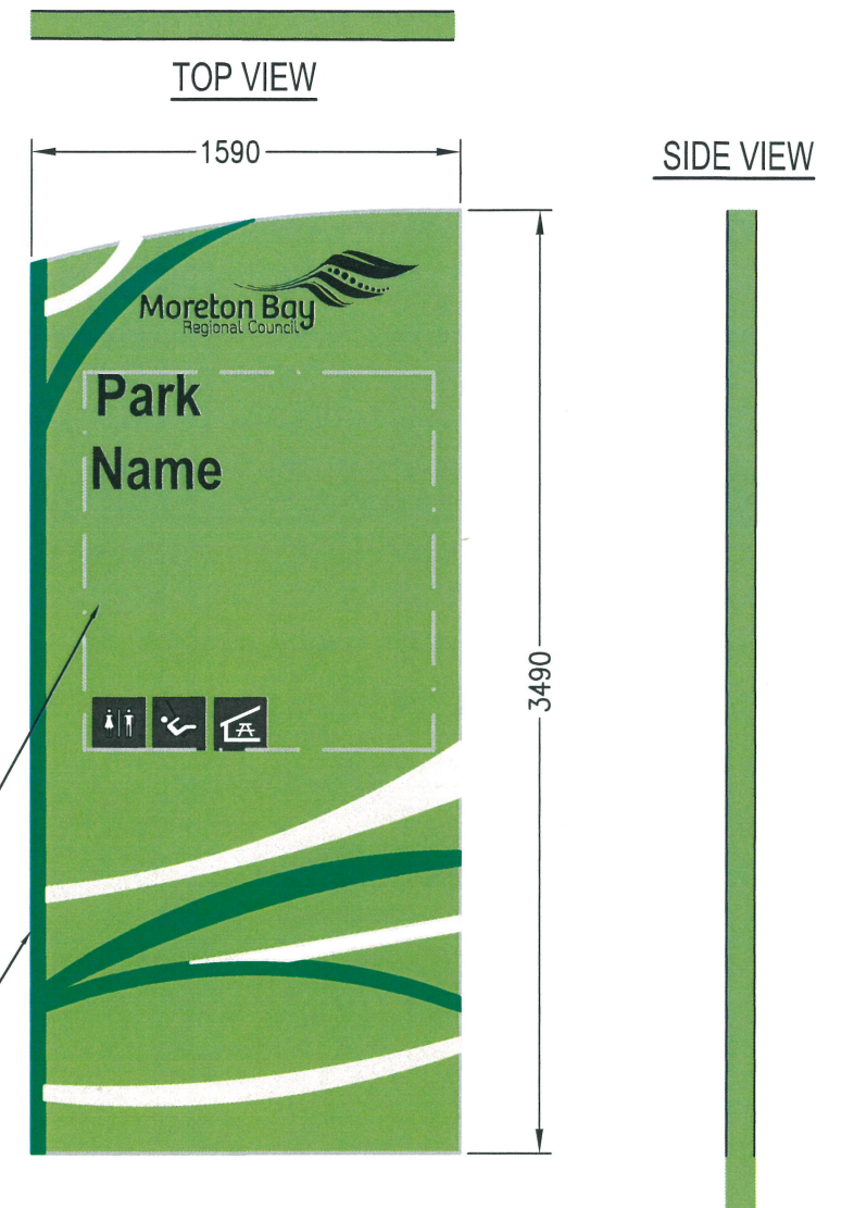
REAR ELEVATION (Optional)

Sign face to be 10mm smaller in width and height than sign frame to reduce sharp edges