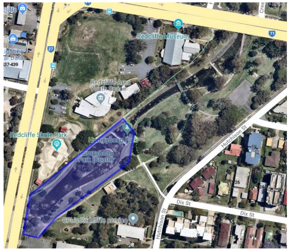
Figure 4: Locality plan - Humpybong Creek Water Quality Improvements Stage 1

The stage 1 work (this contract) is scheduled to commence April 2019 and be completed by July 2019 over a 12-week period, which includes an allowance for wet weather.