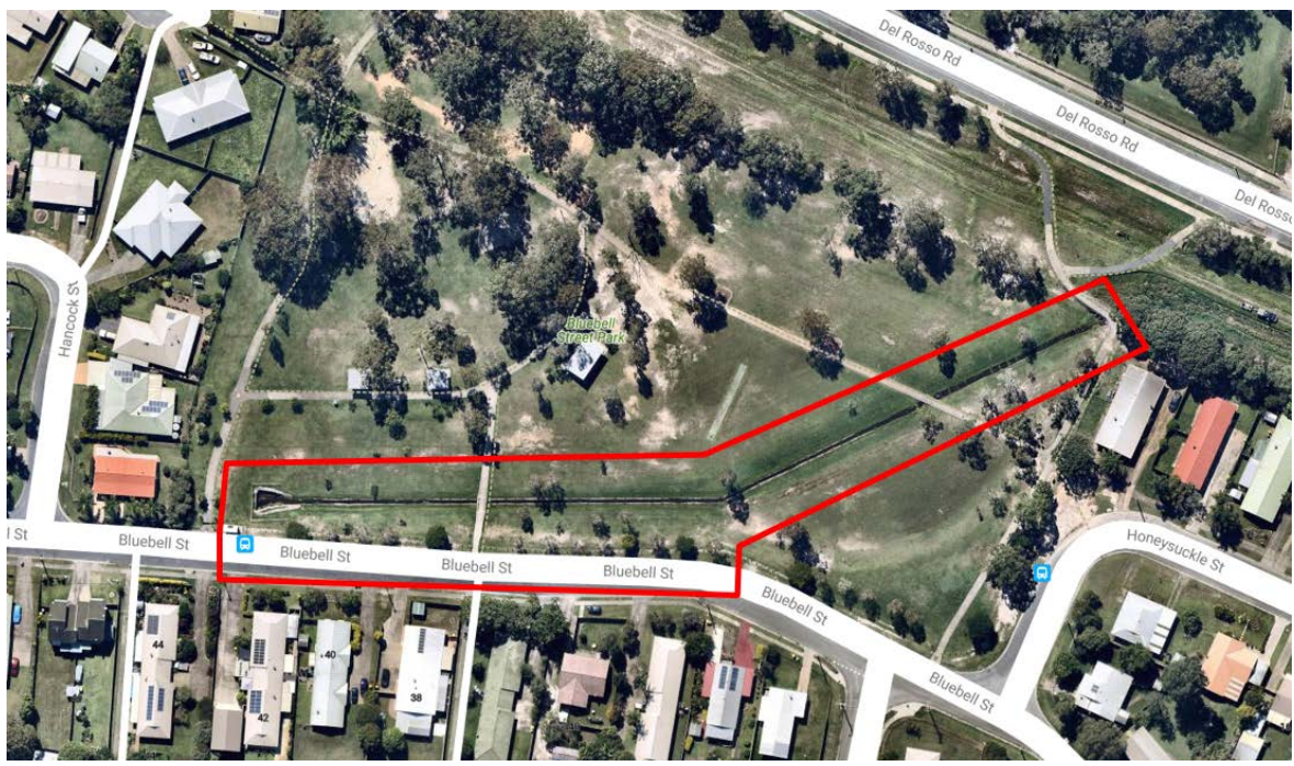
Figure 3: Locality plan - Bluebell Street Park Wetland Stage 1

Construction is programmed to commence April 2019 and conclude June 2019, including an allowance for wet weather of 11 days.