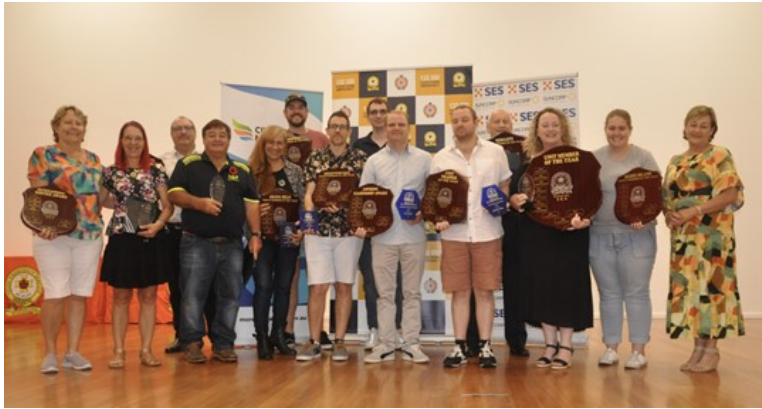
City of Moreton Bay SES Unit Award Recipients at Deception Bay Community Hall

At the State SES Awards Ceremony , the Deception Bay SES Group was awarded the Commissioner's Cup for SES Group of the Year and Moreton Bay Region SES received a Certificate for outstanding support to SES .