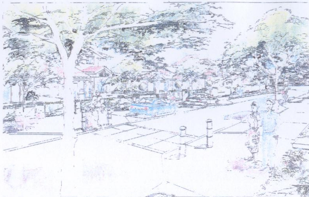
REAR LANE HOUSING FRONTING VILLAGE PARK