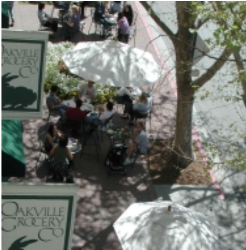
Image 20 – Acceptable Ground floor activities will be encouraged to animate the street and pedestrian spaces.