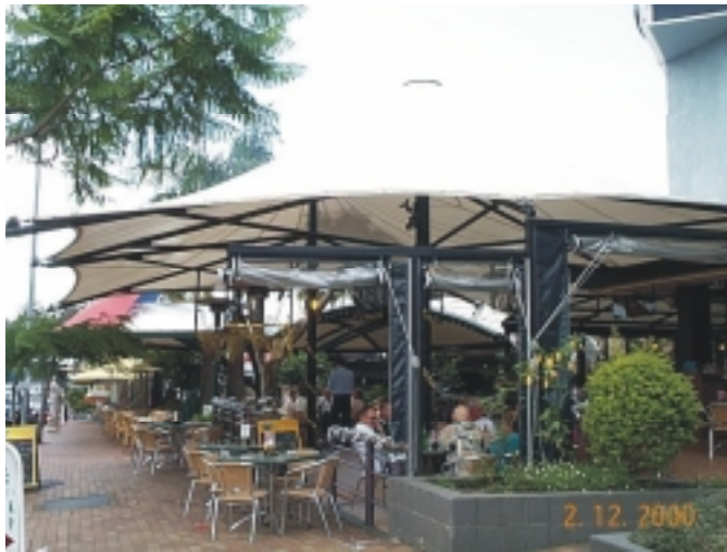
Image 21 – Acceptable Shade structures, outdoor pedestrian streets, courtyards, overhangs, screens and ventilated spaces are an appropriate response for the South-East Queensland climate.