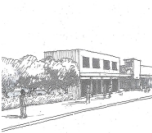
Image 18 – Acceptable New buildings and landscaping works will ensure a continuous urban edge.