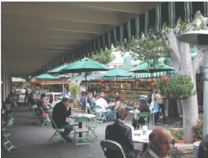
Image 19 – Acceptable Outward oriented activity to animate the adjacent street and pedestrian spaces.