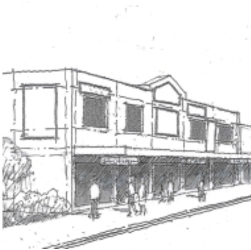
Image 23 – Acceptable Signage and architectural graphics to be coordinated with the building design.