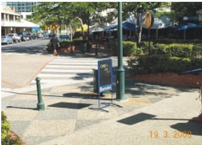
Image 22 – Acceptable Use of paving materials to signify changes in the traffic and pedestrian environment.