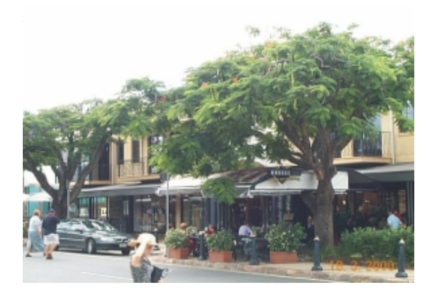
Image 1 – Acceptable Integrated street treatment and landscaping in pedestrian friendly main street environment