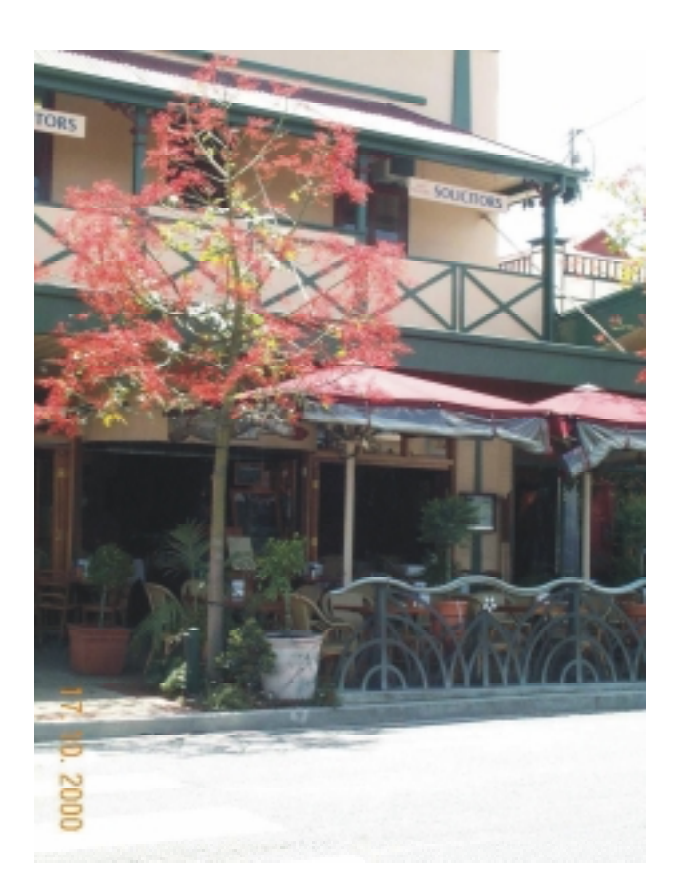
Image 4 – Acceptable Two storey building scale, awnings, outdoor seating, interesting street furniture, and use of footpath contributes to a vibrant main street environment.