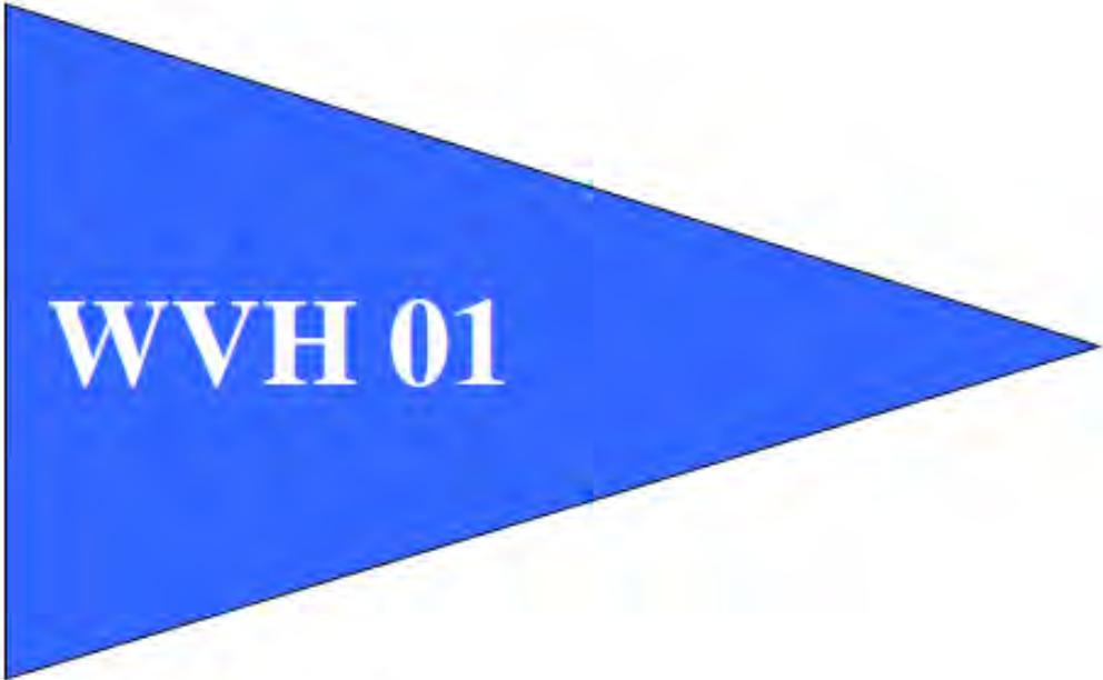
Water Point Direction Marker