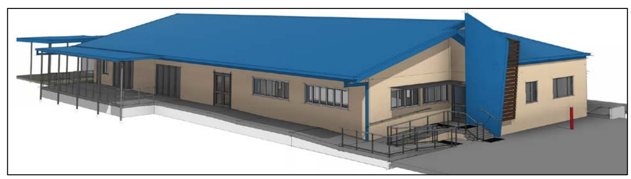
Figure 3 - Artist's Impression

Tenderers were requested to provide prices for the base works as well as the four optional extras giving Council the ability to select desirable works based on the prices received and stakeholder feedback. The optional extras consist of Option 1 (operable wall between activity room 1 and 2), Option 2 (design and construction of front entry ramp veranda), Option 3 (vinyl flooring in function room) and Option 4 (refurbished male and female amenities).