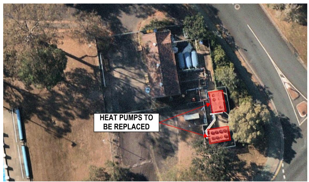
Figure 1: Location of Works - Ferny Hills Swimming Pool

The "Ferny Hills Swimming Pool - Heat Pump Replacement (MBRC008361)" project is located at the Ferny Hill Swimming Pool Complex at Ferny Way, Ferny Hills, Queensland.