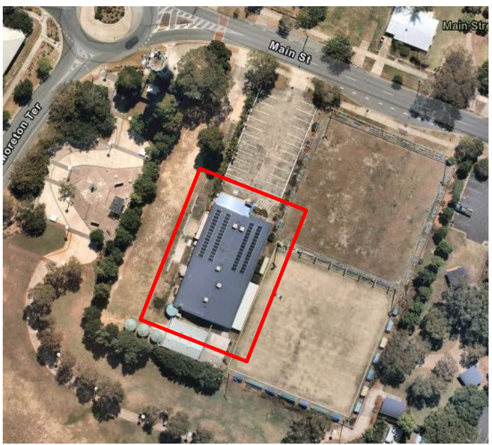
Figure 1 - Location of Community Centre

A budget allocation was provided in the 2018/19 and 2019/20 Council budgets to fund the redevelopment works. The budget allocation covers the detailed design of the redeveloped building as well as the corresponding construction works.