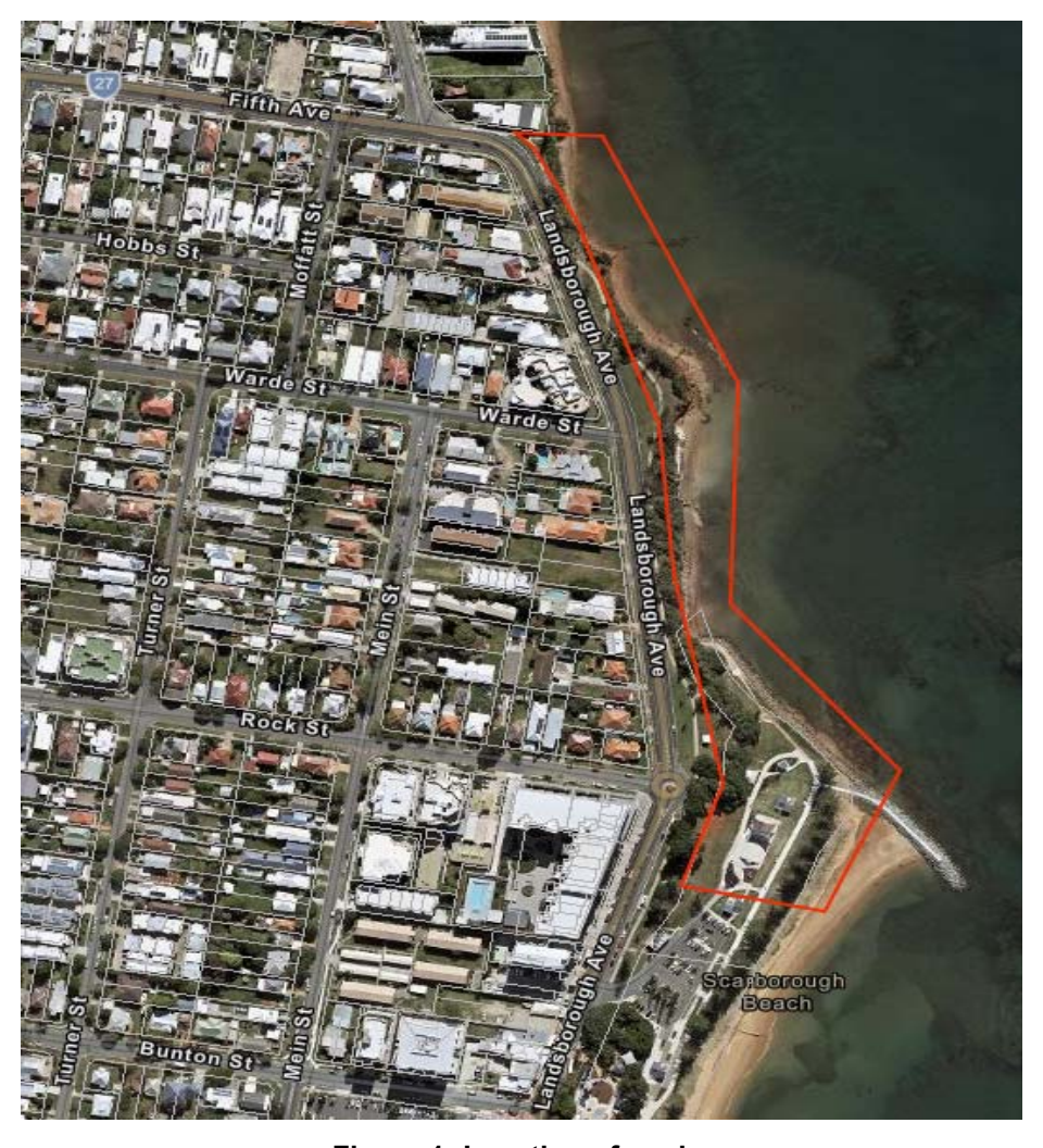
Figure 1: Location of works

ITEM 4.1 SCARBOROUGH - SCARBOROUGH CLIFFS - STABILISATION WORKS - DIVISION 5 - A18963060 (Cont.)