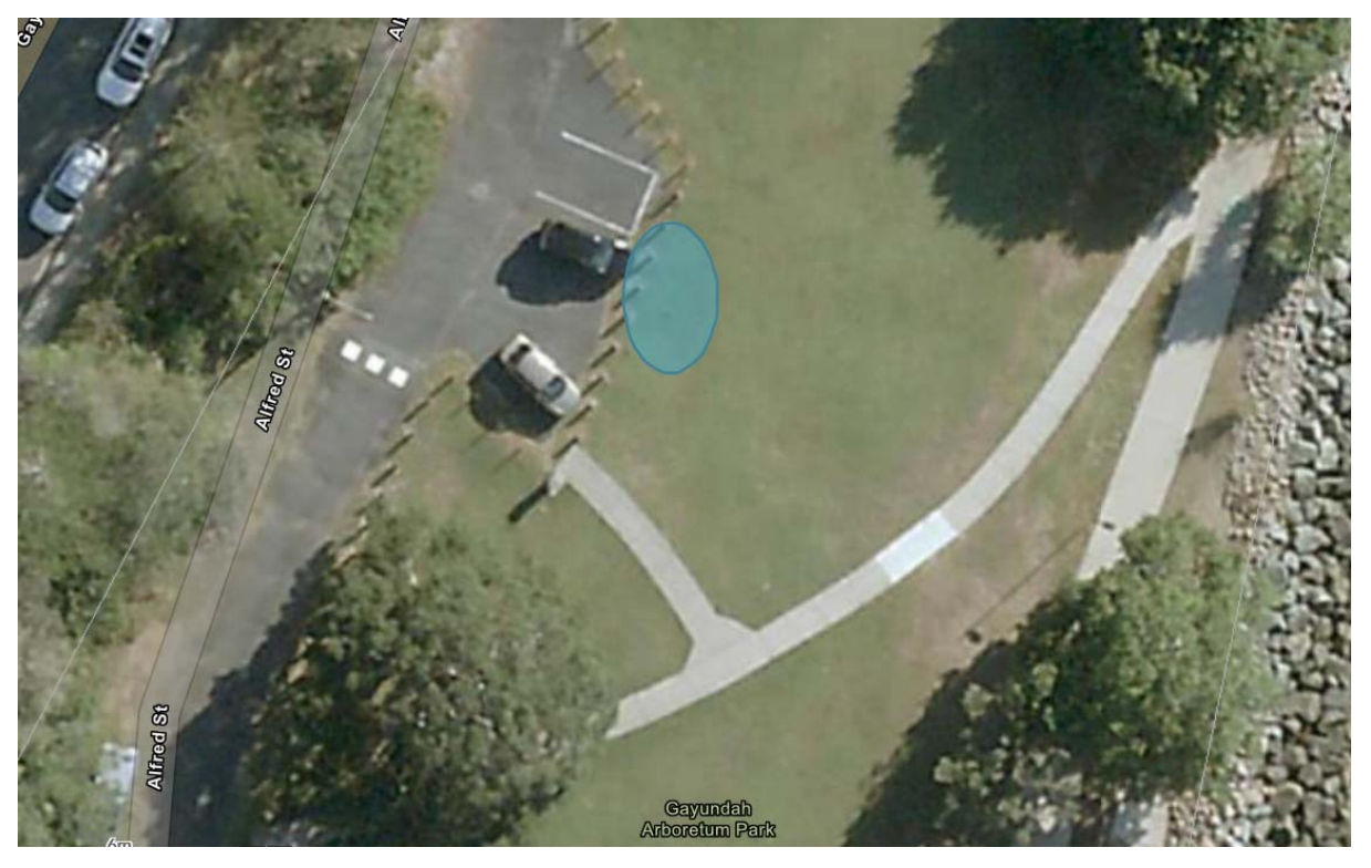
Figure 1: Indicative location of public amenity (toilet)

The tender called for a design and construct delivery that will resolve the toilet's final location, appearance and connectivity, as well as not affecting the function and operation of the existing carpark. The project's duration will be 17 weeks, with construction completed by the end of January 2020.