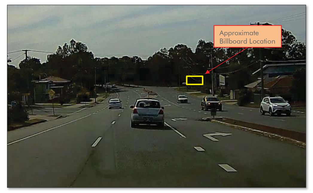
Figure 3.1: VIEW OF SIGN FROM BOARDMAN ROAD NORTHBOUND APPROACH

P:\2018-19\19-451 66 BOARDMAN ROAD, KIPPA RING SIGN\OUTPUTS\19-451 TRAFFIC REPORT.DOCX