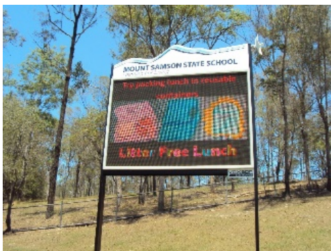
Mount Samson State School promoting their Litter free lunch program on Winn Road.