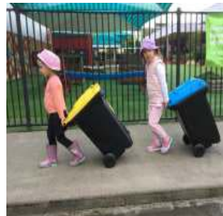
Goodstart North Lakes kids daily trips to the multiple diversion bins (right) & recycling station (left).