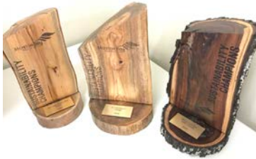
Repurposed timber Sustainability award trophies