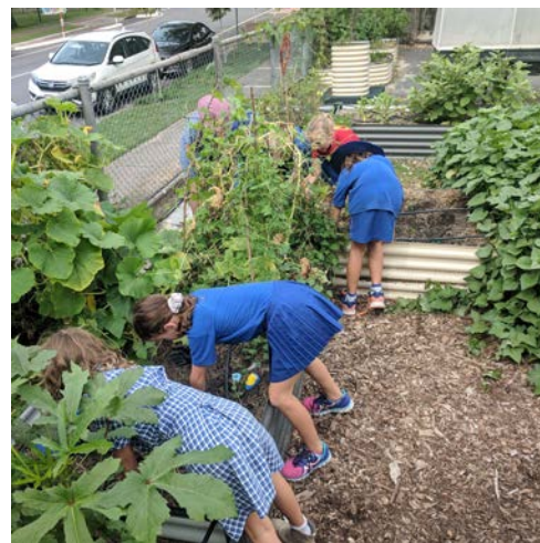
Students immersed in the Mount Samson State School's Stephanie Alexander Garden Kitchen Program gardening (above) and in food preparation training (below).