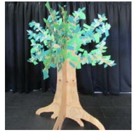
Leaf day with student and staff pledges at Genesis Christian