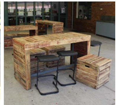
St Columban's College: Cash 4 containers program using old light covers to make collection cages (left) and café furniture from recovered pallets (right)