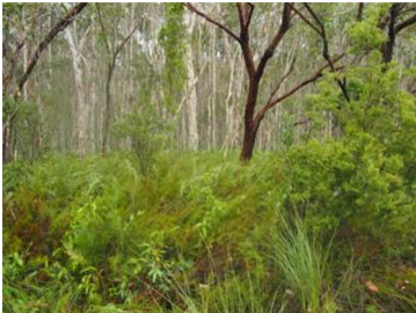
Figure 2: RE 12.3.5