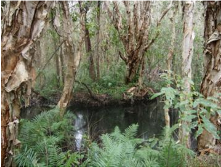
Figure 1: habit including Melaleuca quinquenervia , Blechnum indicum and Alphitonia excelsa