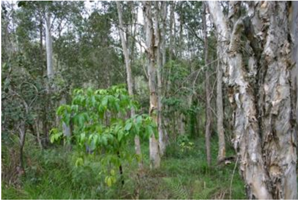
Figure 3: RE 12.3.5 Floodplain Broadleaf Paperbark open forest to woodland