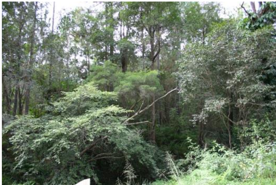
Figure 1: RE 12.3.14a Floodplain Scribbly Gum woodland to open forest

Conservation status: Vegetation Management Act (Qld) 1999 - of Concern