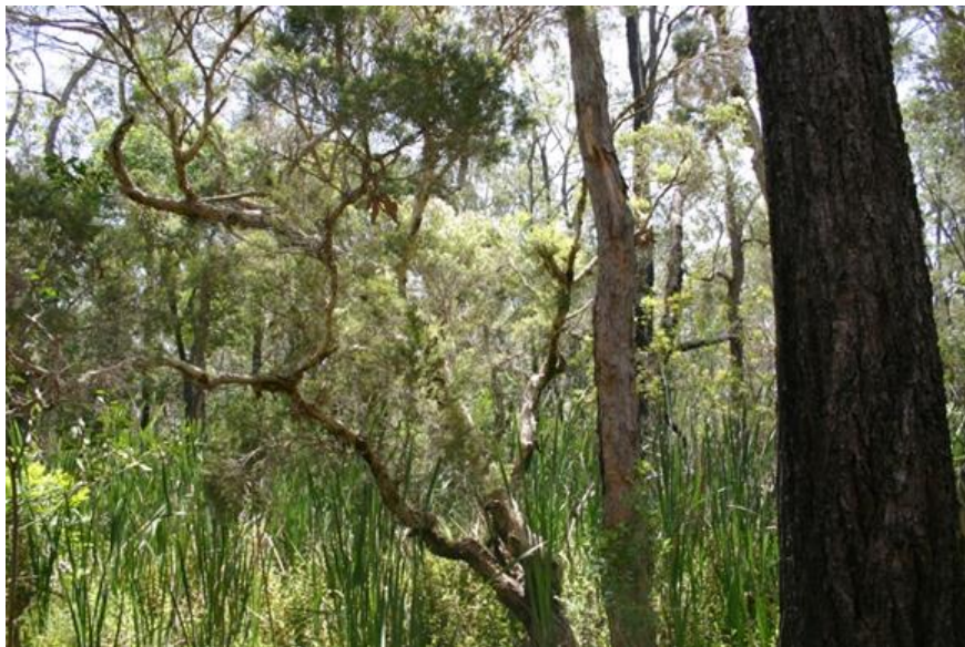
Figure 2: RE 12.3.11