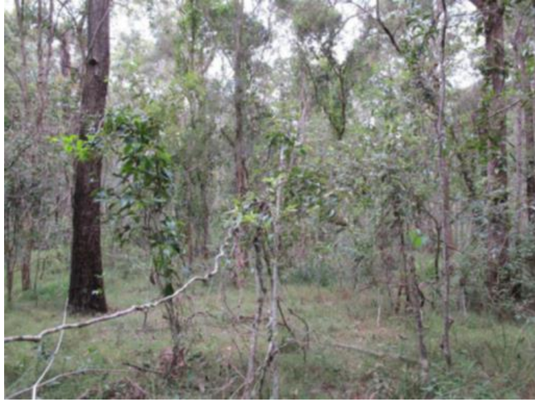
Figure 1: RE 12.3.11 by Melinda Laidlaw in Queensland Government, 2012, 'BioCondition benchmark for regional ecosystem condition assessment Southeast Queensland Regional ecosystem: 12.3.11'