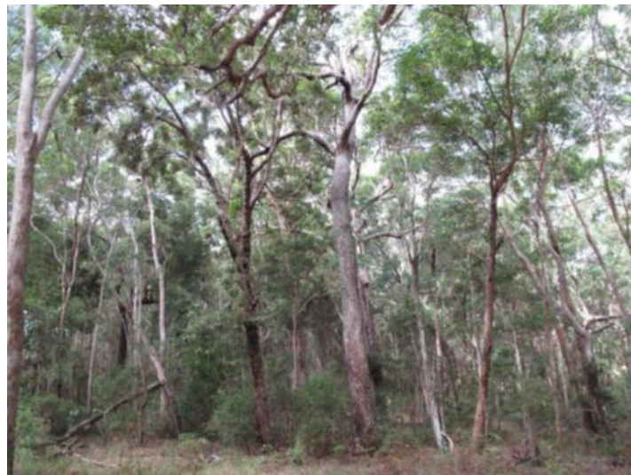
Figure 1: RE 12.2.5 Photo by Melinda Laidlaw in Queensland Government, 2012, 'BioCondition benchmark for regional ecosystem condition assessment Southeast Queensland Regional ecosystem 12.2.5.'

Conservation status: Vegetation Management Act (Qld) 1999 - Least concern (37.59 % remaining locally)