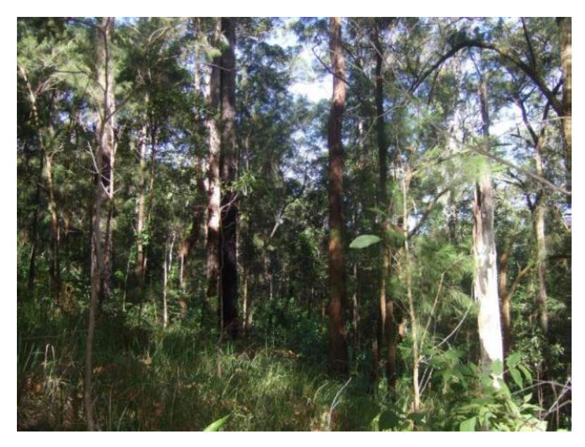
Figure 1: RE 12.12.15 by Tim Ryan- in Queensland Government, 2012, 'BioCondition benchmark for regional ecosystem condition assessment'.

Conservation status: Vegetation Management Act (Qld) 1999 - not of concern (61.26 % remaining locally)