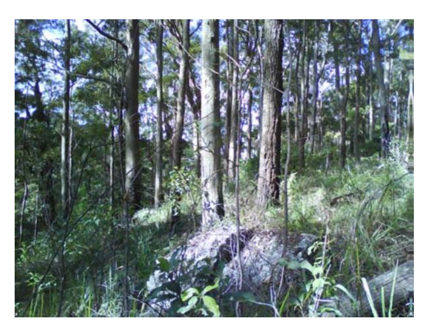
Figure 1: RE 12.11.3 photo by Tim Ryan in Queensland Government, 2012, 'BioCondition benchmark for regional ecosystem condition assessment Southeast Queensland Regional ecosystem:12.11.3'

Conservation status: Vegetation Management Act (Qld) 1999 - least concern (55.15 % remaining locally)