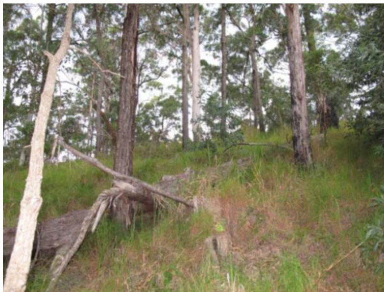
Figure 1: RE 12.11.5 by Adrian Borsboom - in Queensland Government, 2012, 'BioCondition benchmark for regional ecosystem condition assessment Southeast Queensland Regional ecosystem:12.11.5'

Conservation status: Vegetation Management Act (Qld) 1999 - not of concern (46.34 % remaining locally)