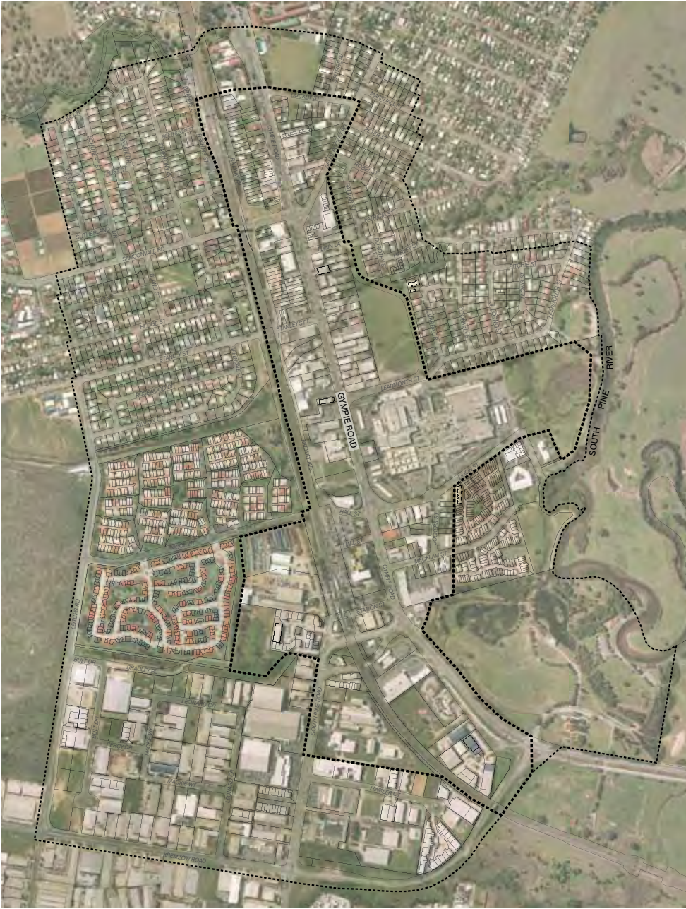
Figure 1.4.1 Strathpine Activity Centre Boundary

The Strathpine Major Regional Activity Centre (SMRAC) study area is centered on the Gympie Road retail strip located between Strathpine and Bray Park Railway Stations (refer Figure 1.4.1). The area encompasses a range of centre uses including the Westfield Strathpine Shopping Centre, civic uses including Council offices, courthouse and library, Pine Rivers High School, the Riverview Private Hospital, main street retail and services, and industrial uses associated with the northern section of Brendale industrial area. The SMRAC core area is surrounded by a residential hinterland comprised primarily of low density housing but including a number of community title attached housing precincts of a relatively low density.