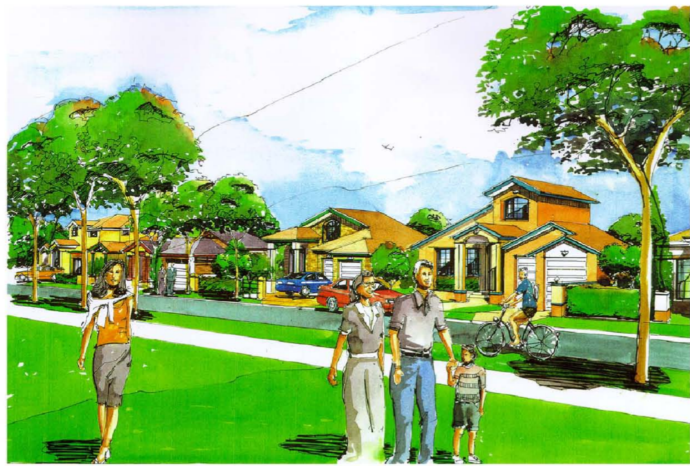
SMALLER LOT HOUSING