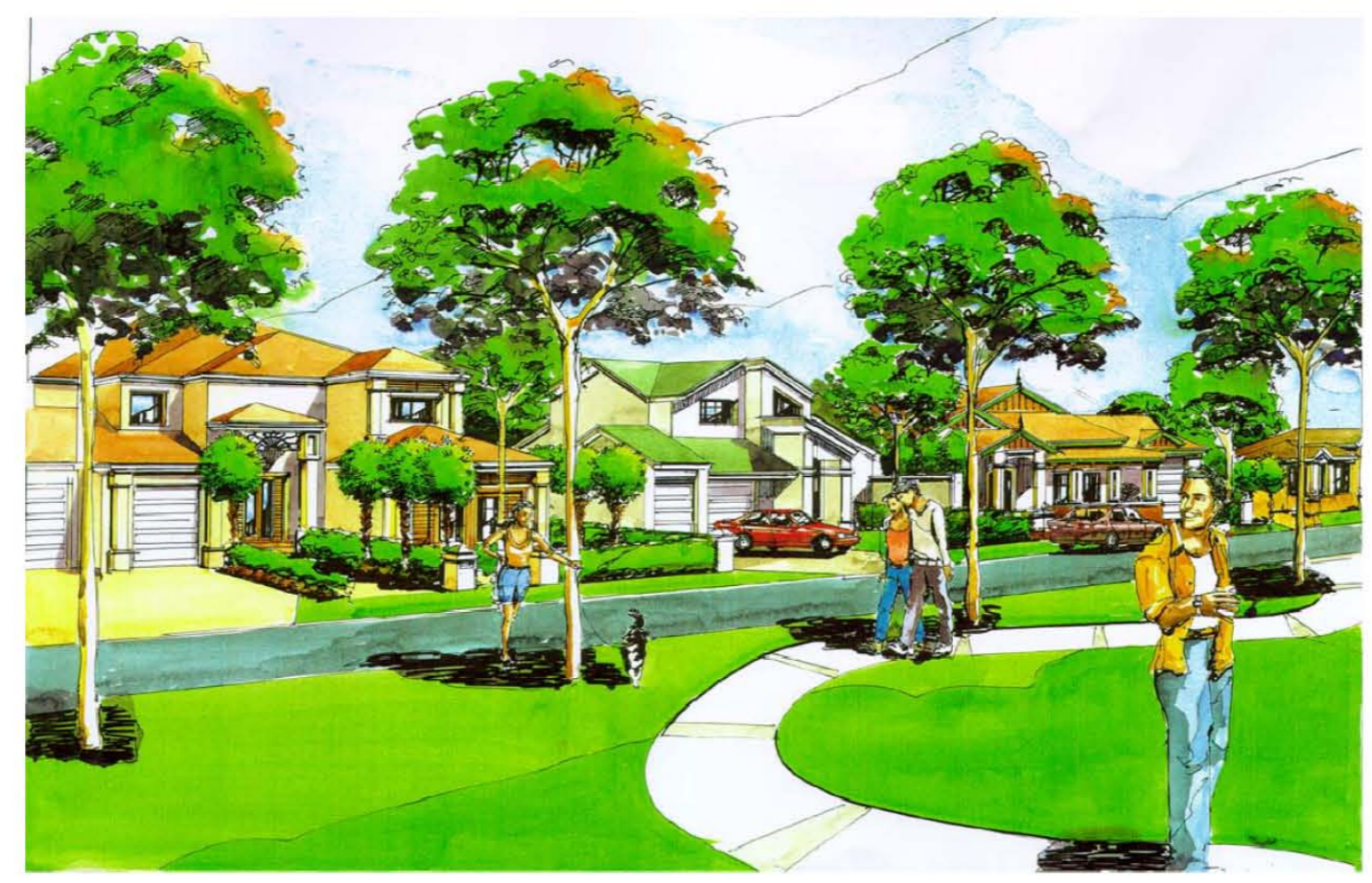
TRADITIONAL HOUSING FRONTING LINEAR PARK

CENTRAL GOLF SECTOR 50 INDICATIVE RESIDENTIAL STREETSCAPES