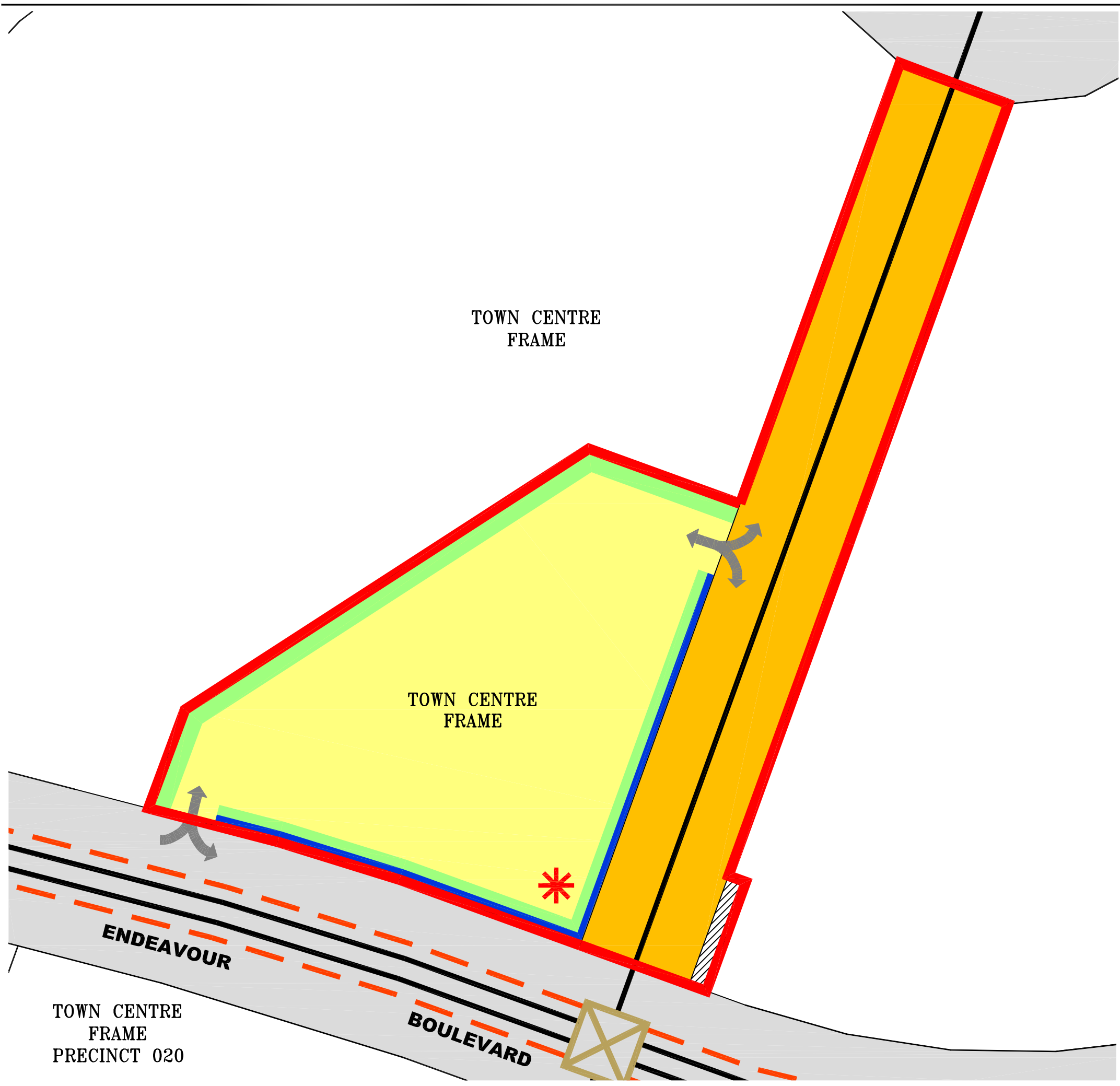
TCF Public Transport 'C' Precinct PRECINCT PLAN MAP