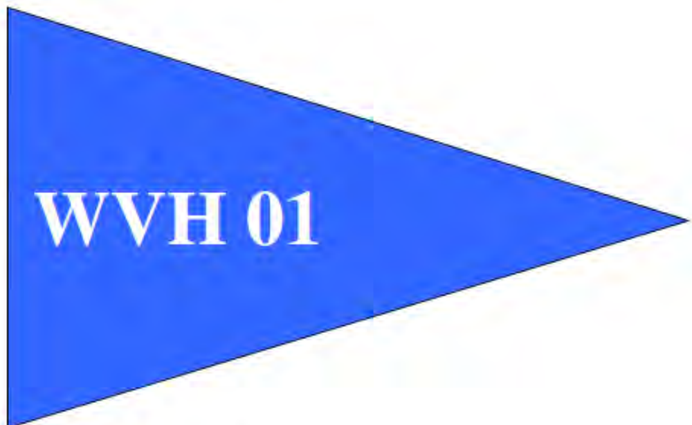
Water Point Direction Marker