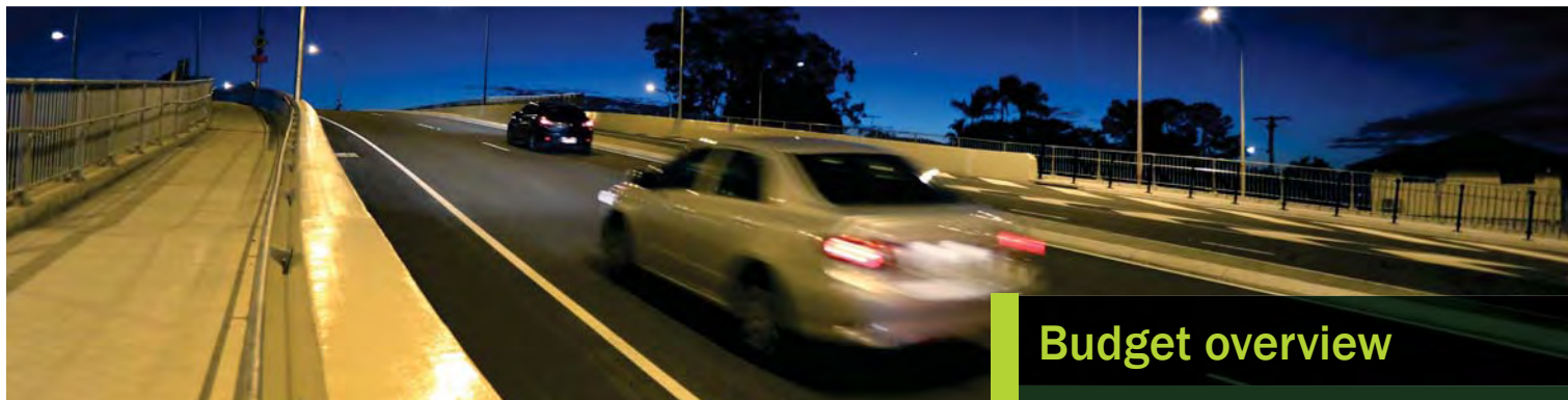
Mayor Allan Sutherland Moreton Bay Regional Council

These region-building projects are evidence of council's determination to invest in the essential services and infrastructure for our growing region through a strong, sustainable and balanced budget.