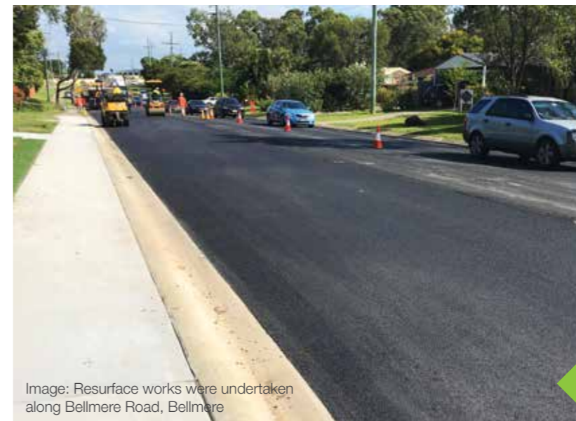
Image: Resurface works were undertaken along Bellmere Road, Bellmere

Council maintained more than 3469 kilometres of sealed road, as well as a further 214 kilometres of unsealed road.