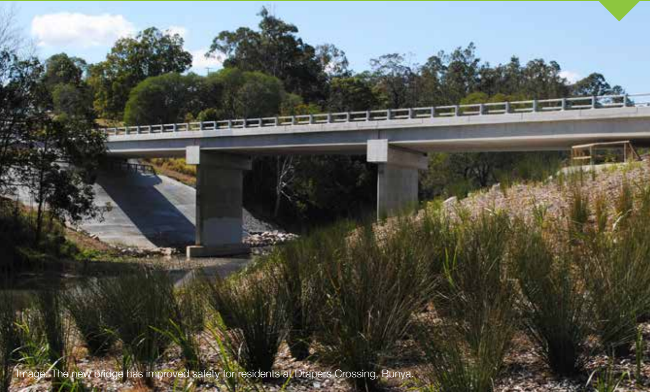
Image: The new bridge has improved safety for residents at Drapers Crossing, Bunya.

Council officially opened a $5 million flood-resilient bridge over Drapers Crossing, Bunya - the project was funded in part through the Federal Government's Bridge Renewal Program.