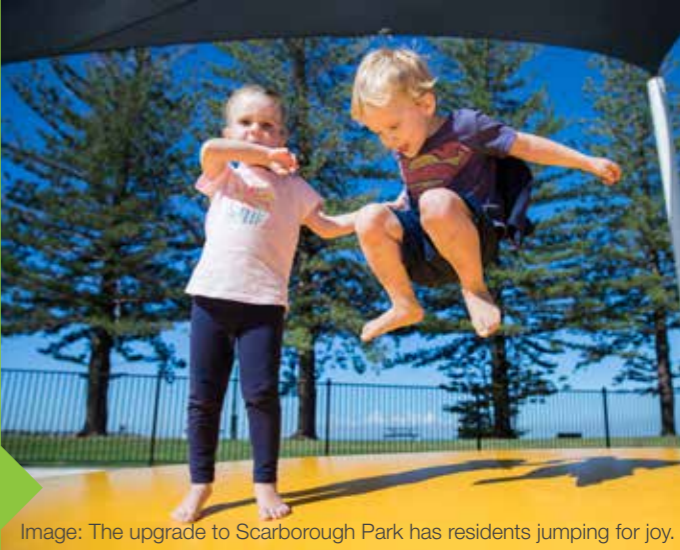
Image: The upgrade to Scarborough Park has residents jumping for joy.

Completed a $2.5 million upgrade of Scarborough Beach Park, featuring the region's first jumping pillow, all-abilities picnic facilities, viewing areas, basketball half-court, giant chess set, new playground, BBQ areas and improved car parking.