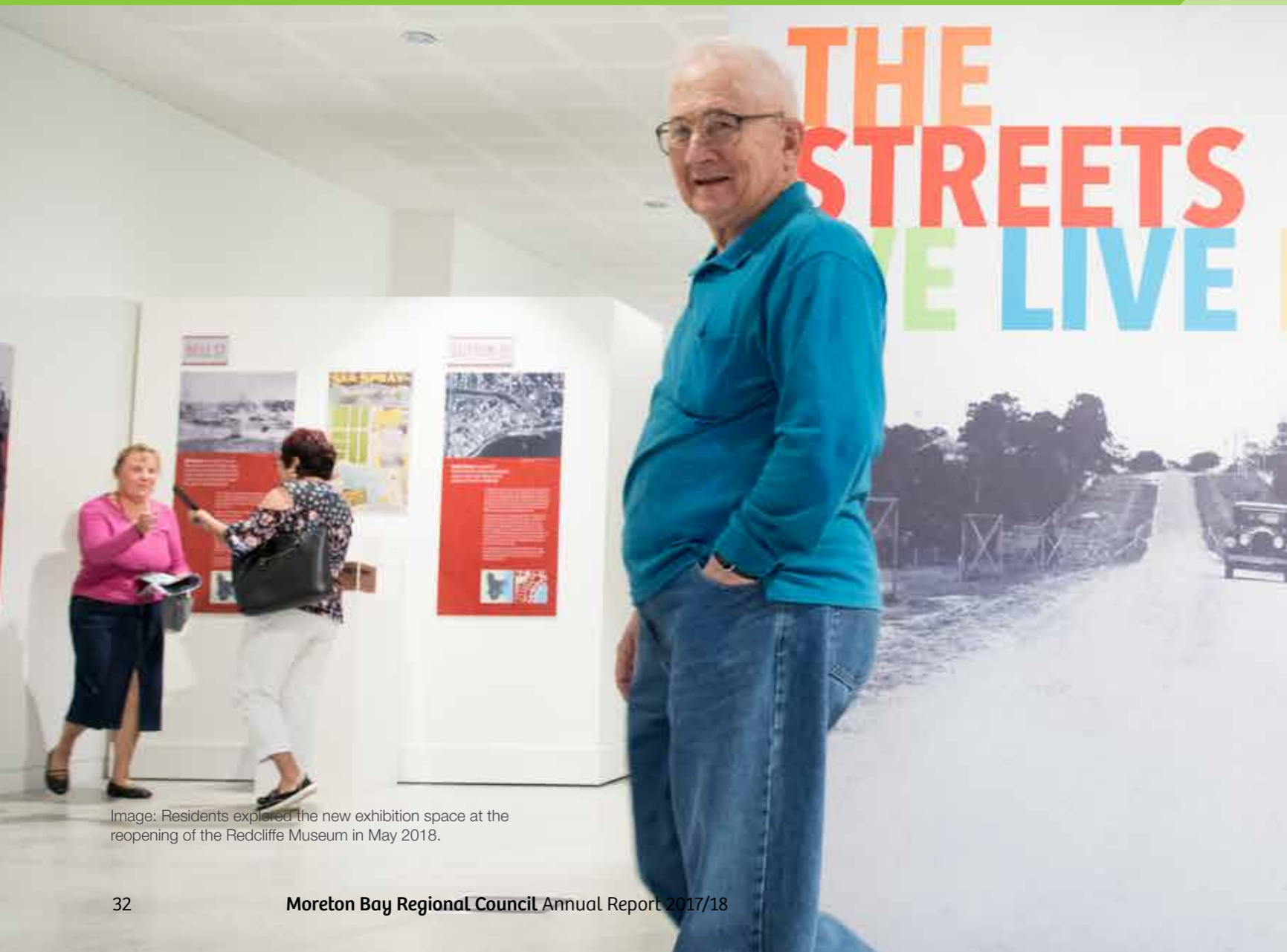
Image: Residents explored the new exhibition space at the reopening of the Redcliffe Museum in May 2018.