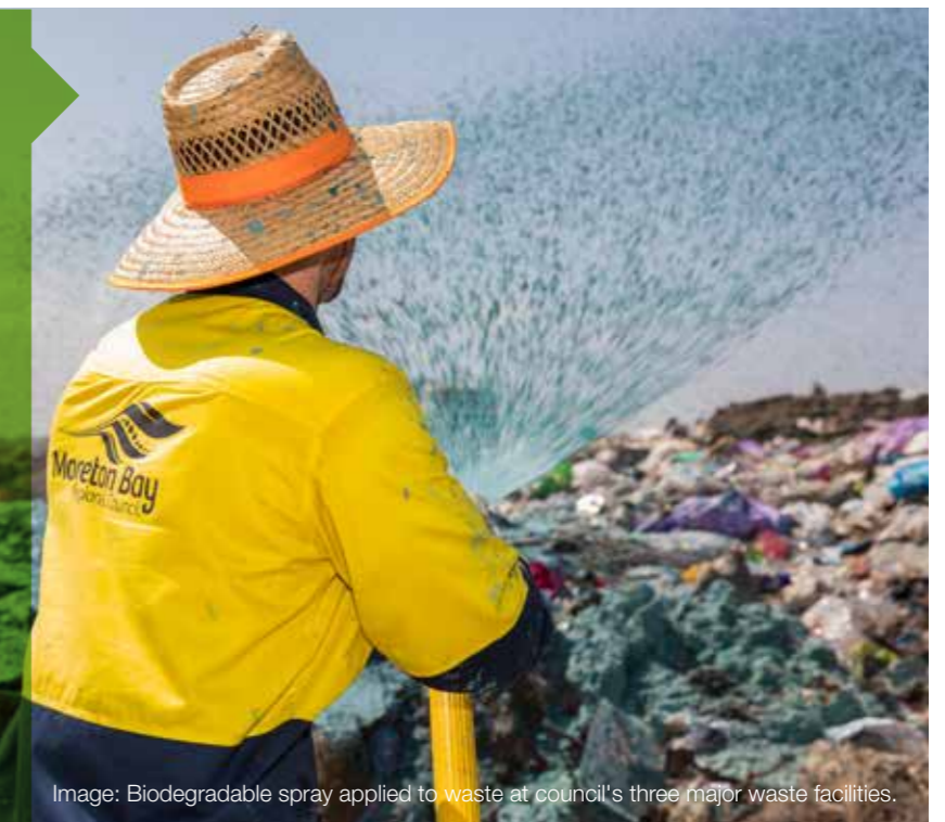
Image: Biodegradable spray applied to waste at council's three major waste facilities.

Successfully trialed a biodegradable spray to cover daily waste at three waste facilities. The spray has reduced odour, dust and fire risk, and increased the lifespan of these facilities by more than 20 years.