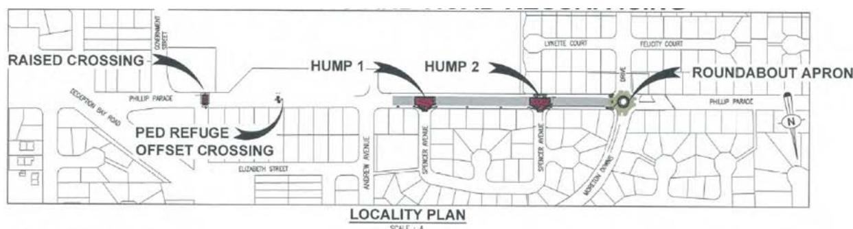
Figure 2: Works plan - Phillip Parade, Deception Bay

Project is on the boundary between Divisions 4 and 5.