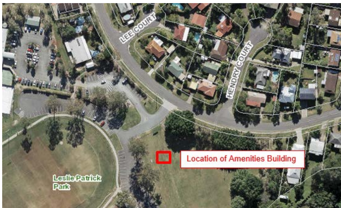
Figure 1: Location of amenities building

Design is scheduled to commence in July 2019 and site construction works are expected to commence in September 2019 and be completed by October 2019, which includes an allowance for wet weather.