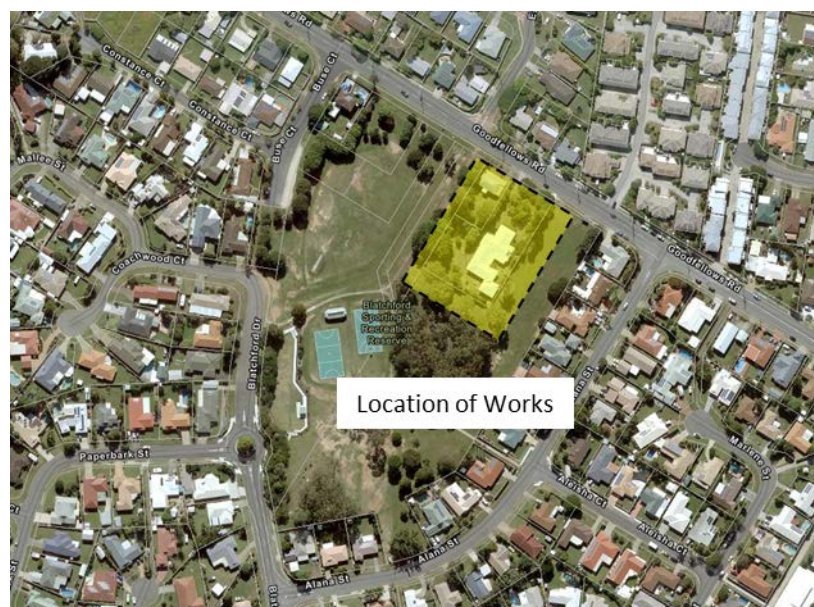
Figure 1: Location of works

Construction onsite will be of approximately 13 weeks' duration, including an allowance for wet weather. Works are scheduled to commence in July / August 2019 with completion by November 2019.