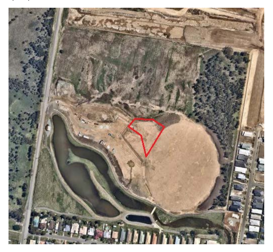
Figure 2: Location plan - Clubhouse at Nathan Road Sporting Precinct

ITEM 4.1 ROTHWELL - NATHAN ROAD - SPORTING STAGE 1 (CLUBHOUSE CONSTRUCTION) - DIVISION 5 - A18577943 (Cont.)