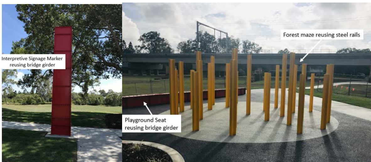
Figure 3: Work already completed under the 2018/19 project - Lawnton - Leis Park - Playground and Picnic Facility Upgrade