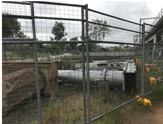
Figure 2: Salvaged bridge elements stockpiled in Leis Park