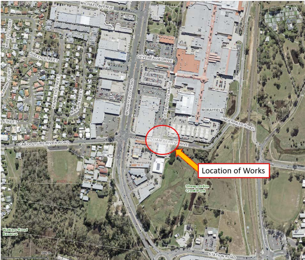
Figure 1: Locality plan