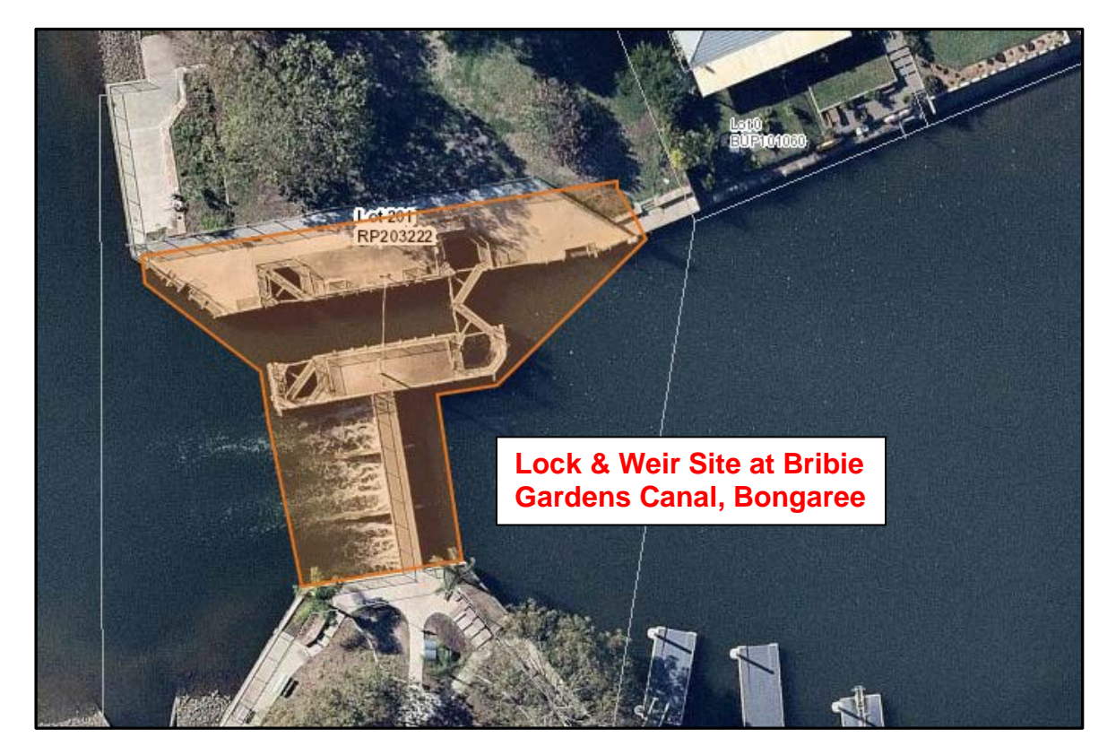
Figure 2 - Bribie Gardens Lock and Weir - Location

Periodic major maintenance of the navigation lock and weir structures, key mechanical and ancillary components is required to ensure that the lock provides the intended level of service and that safety of operation is maintained. The previous maintenance project involving a similar scale of works, (including draining of the lock, removal and repair of the steel lock gates and mechanical systems) occurred in 2004. The current project is included within the scheduled maintenance program of the Bribie Gardens Long Term Maintenance Plan, and the Canals Asset Management Plan.