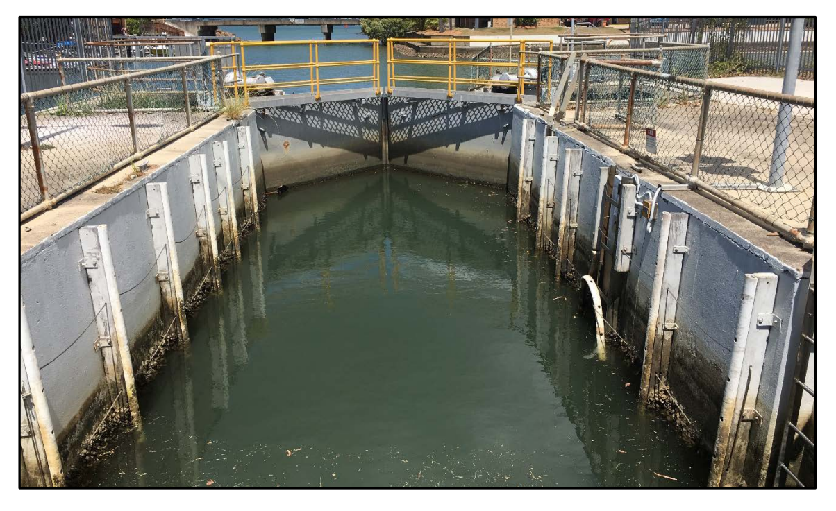
Figure 3 - View inside the lock bay, with lock gate and safety walkway in background