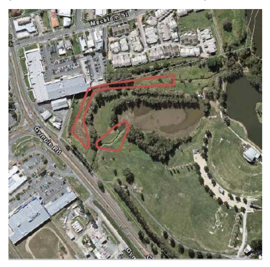
Figure 1: Location of works

The project is programmed to commence in June 2019 and conclude August 2019.