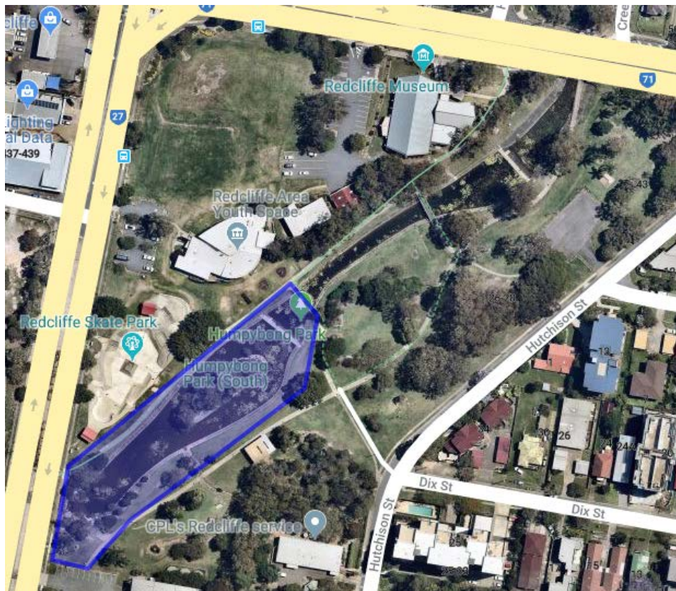
Figure 4: Locality plan - Humpybong Creek Water Quality Improvements Stage 1

The stage 1 work (this contract) is scheduled to commence April 2019 and be completed by July 2019 over a 12-week period, which includes an allowance for wet weather.