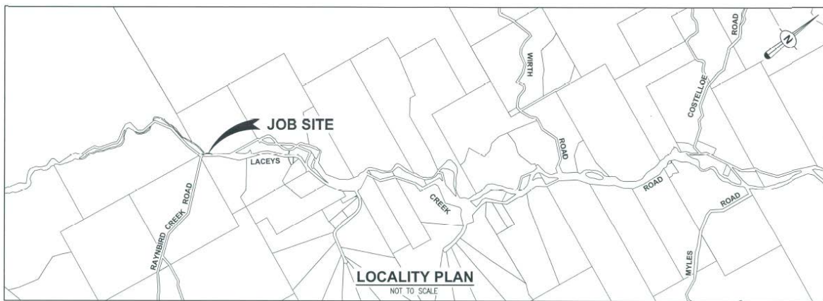
Figure 1: Locality plan - Laceys Creek Road, Laceys Creek

Works on site are scheduled to commence in March 2019 and be completed by June 2019 over a 14-week period, which includes an allowance for wet weather.