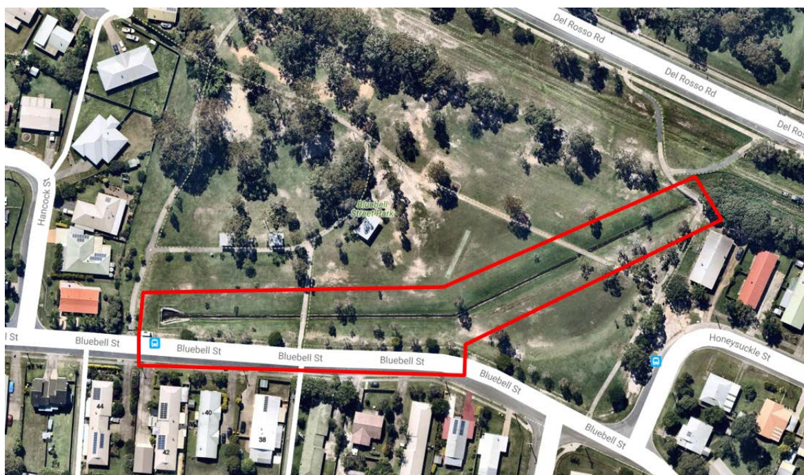
Figure 3: Locality plan - Bluebell Street Park Wetland Stage 1

Construction is programmed to commence April 2019 and conclude June 2019, including an allowance for wet weather of 11 days.