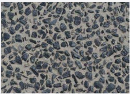
Hansoncrete Expose 'Charcoal'