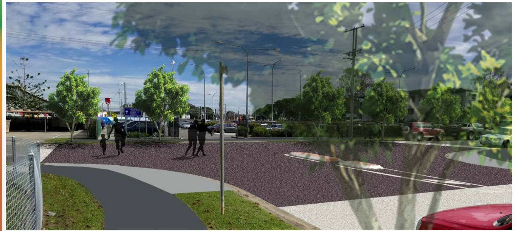
Artists Impression. Shared Zone treatment at the intersection of Walter Street and Mortimer Street, Caboolture.