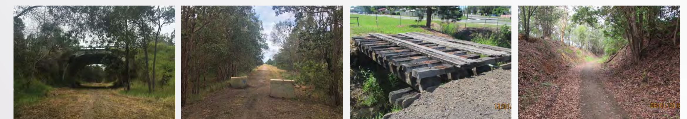
Existing Trail Conditions