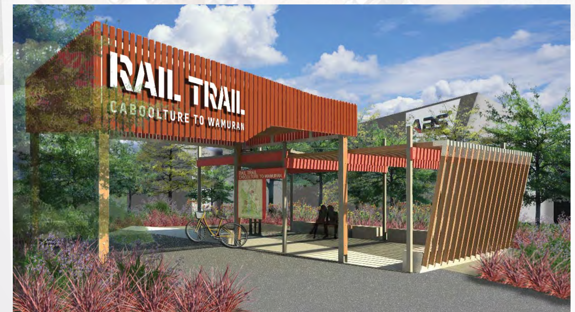
Proposed Trail Head Shelter located on Beerburrum Road.

Visit: www.moretonbay.qld.gov.au/CWRailTrail or, contact Council on (07) 3205 0555 or, email the Project team at: completestreets@moretonbay.qld.gov.au