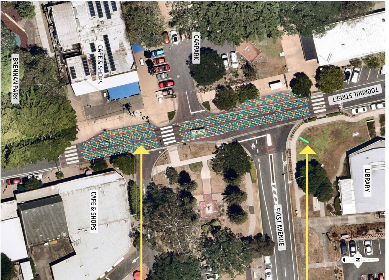
LOCATION AND DETAIL OF NEW ARTWORK FOR BONGAREE