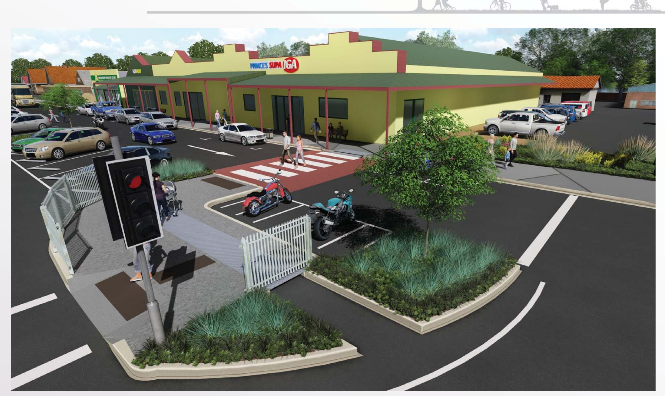
Artists impression; Crossing at the IGA