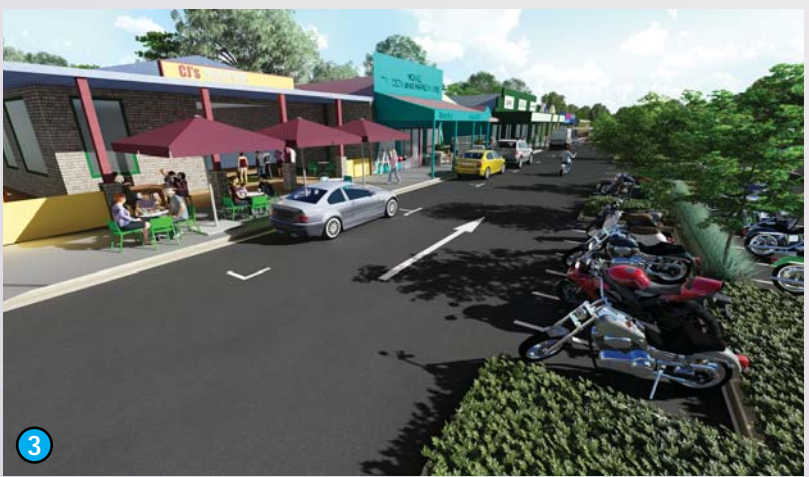
Artists impression; CJ's Pastries