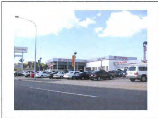
Image 9 – Unacceptable

Incoherent layout and access arrangement with no landscaping to soften and enhance the built form. Unattractive built form and roofscape that does not provide visual relief or provide visual interest for passers by.