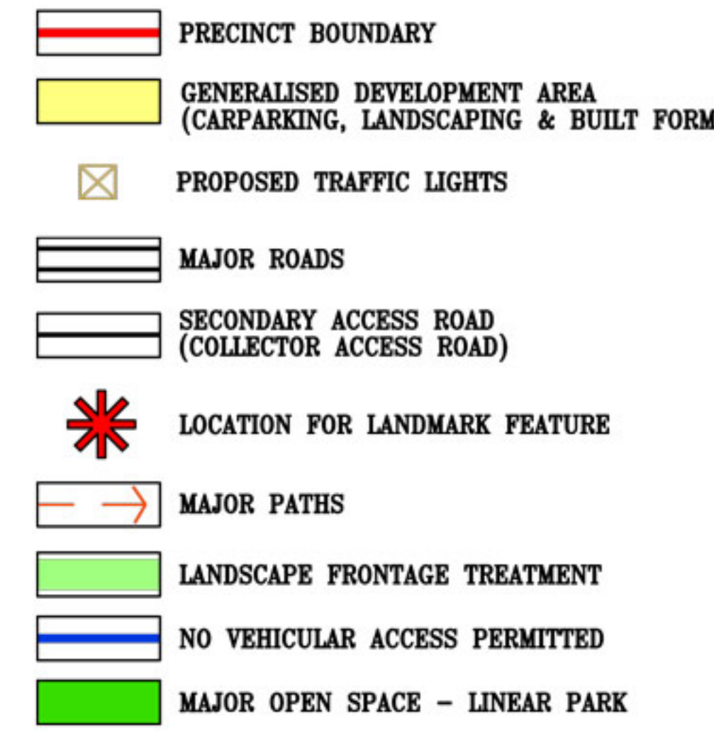
Mixed Industry & Business 'A' Precinct Mixed Industry & Business 'A' Sector Two PRECINCT PLAN MAP