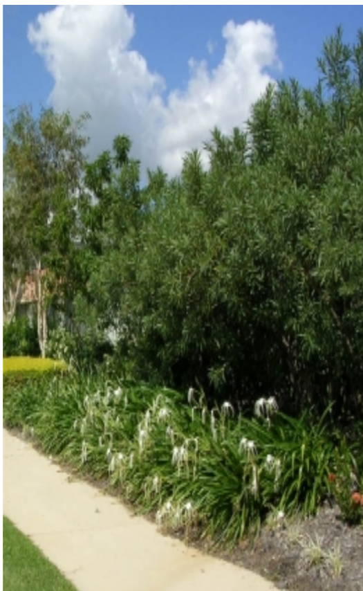
Native planting to 5m buffer zone