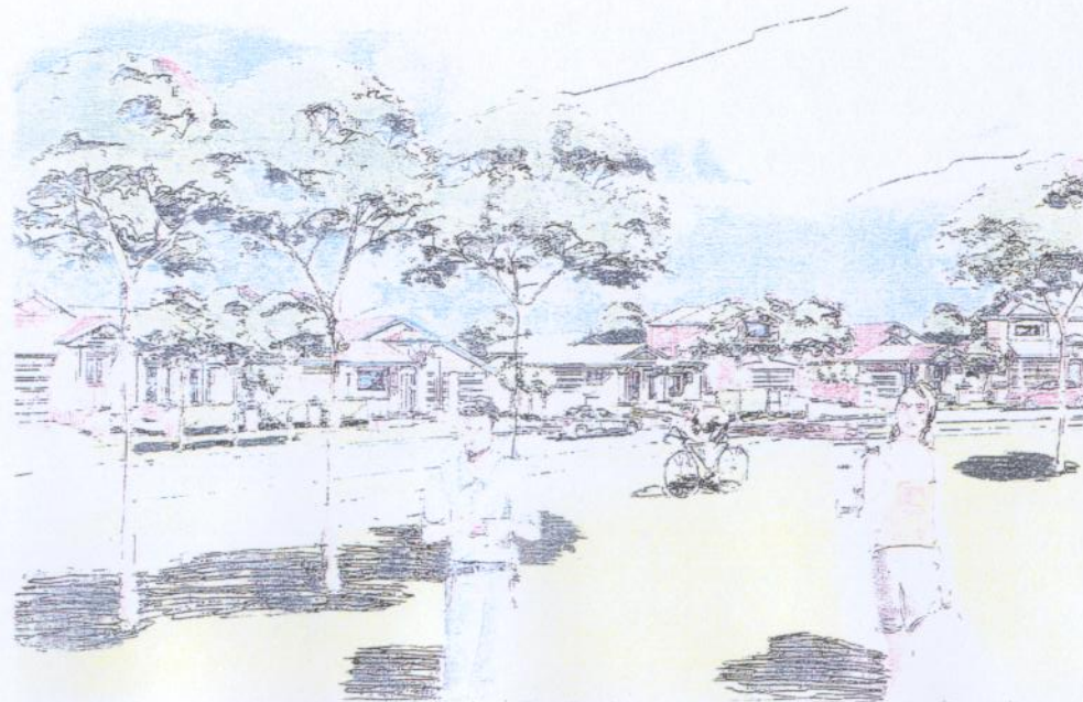
VILLA AND COURTYARD HOUSING FRONTING LOCAL PARK