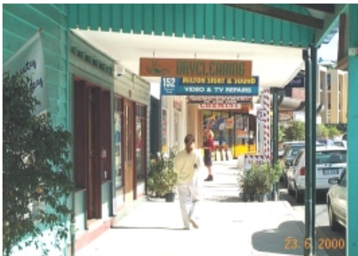
Image 13 – Acceptable Development will present active frontages addressing the street.