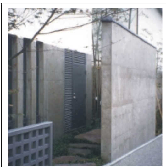
Image 16 – Acceptable Appropriate screening of service areas where CPTED principles are not compromised.