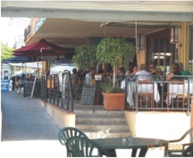
Image 14 – Acceptable Changes of grade appropriately handled while maintaining open, active frontages.