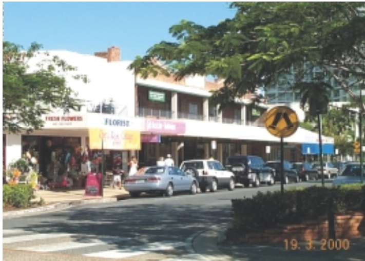
Image 12 – Acceptable Development integrated with landscaping and paving treatments create a main street environment.