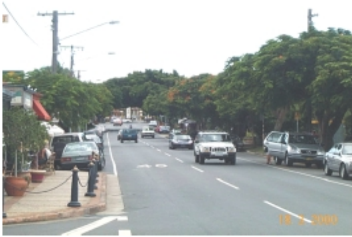
Image 11 – Acceptable Kerb build outs and pedestrian accessibility contribute to a pedestrian friendly environment.