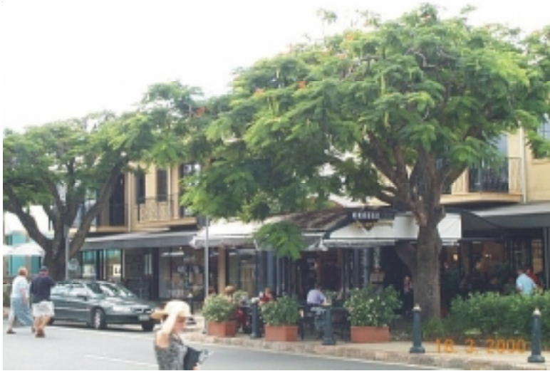
Image 1 – Acceptable Integrated street treatment and landscaping in pedestrian friendly main street environment