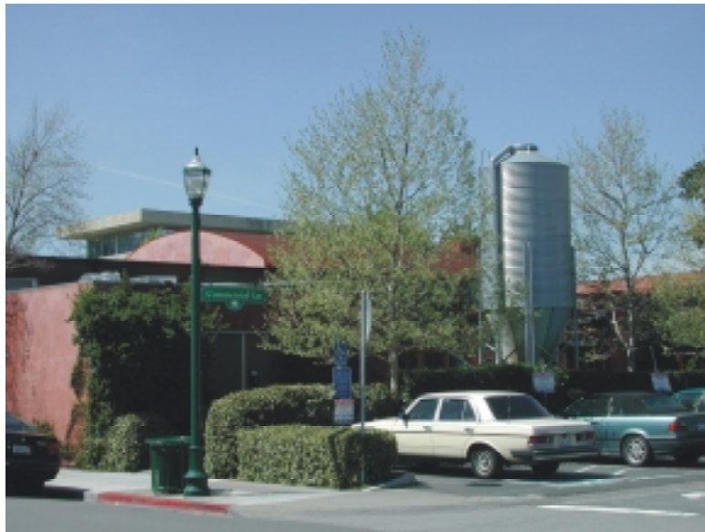
Image 2- Acceptable Effective use of landscaping in parking area