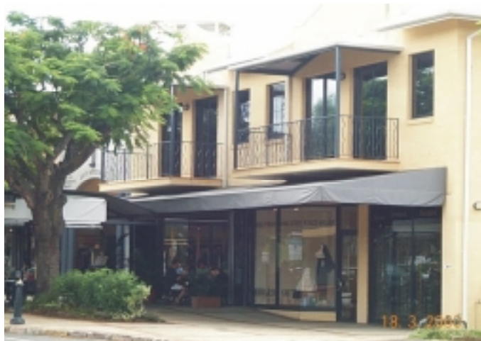
Image 5 – Acceptable Buildings defining the street environment, generous footpaths and a high quality urban design character.