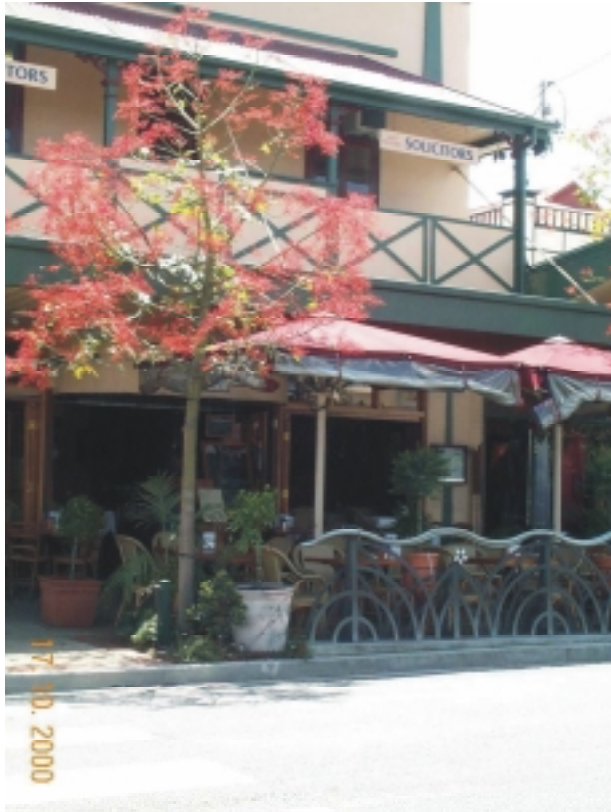
Image 4 – Acceptable Two storey building scale, awnings, outdoor seating, interesting street furniture, and use of footpath contributes to a vibrant main street environment.