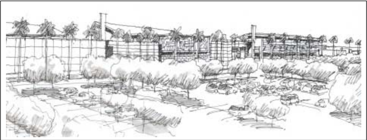
Image 51 - Unacceptable. Landscape screening around the sector perimeter must ensure that the car park areas are significantly screened from a driver's eye and take into account limited viewing opportunities to the buildings.