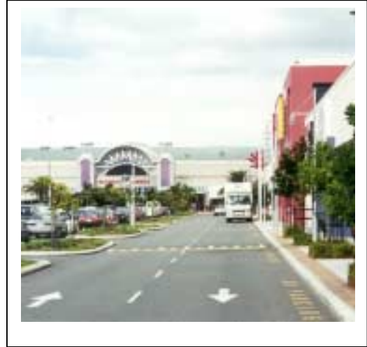
Image 47 - Unacceptable. Landscaping in car parks is to provide both shade and definition.