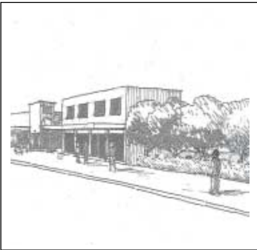
Image 48 - Acceptable. Establish a strong landscape built edge where a car park abuts North Lakes Drive until built form is constructed.