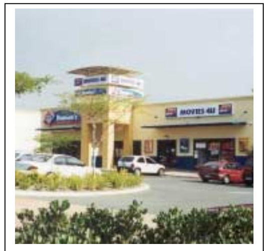
Image 54 and 55 - Acceptable. Features that create landmarks and give scale to the mass of large scale building elements.