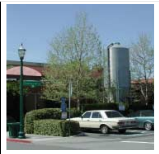
Image 50 - Acceptable. Attractive landscaped edge to car park including variations in height and type of planting edge.