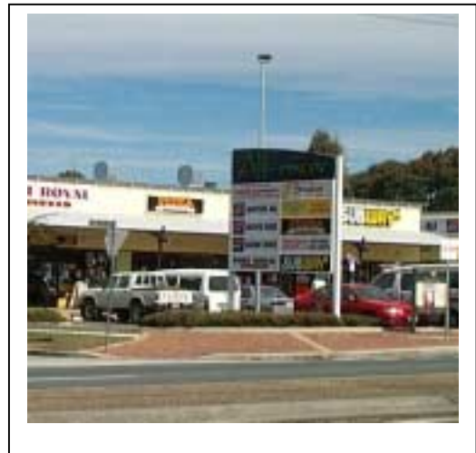
Image 49 - Unacceptable. Inadequate landscape between road and car park.