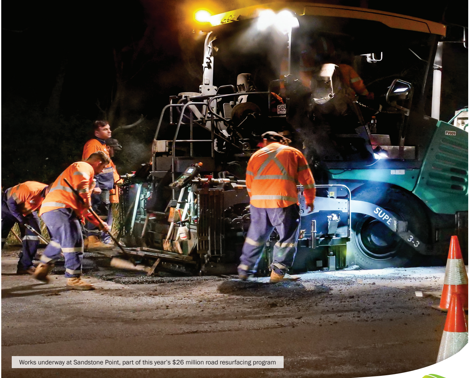
Works underway at Sandstone Point, part of this year's $26 million road resurfacing program

CREATING OPPORTUNITIES STRENGTHENING COMMUNITIES VALUING LIFESTYLE