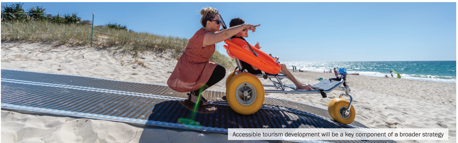
Accessible tourism development will be a key component of a broader strategy