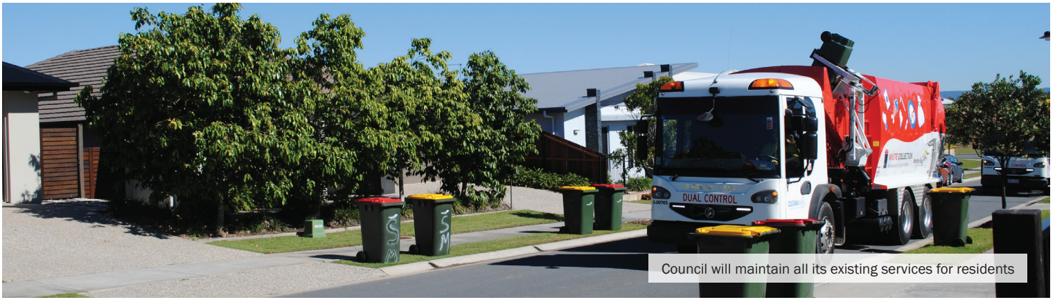
Council will maintain all its existing services for residents