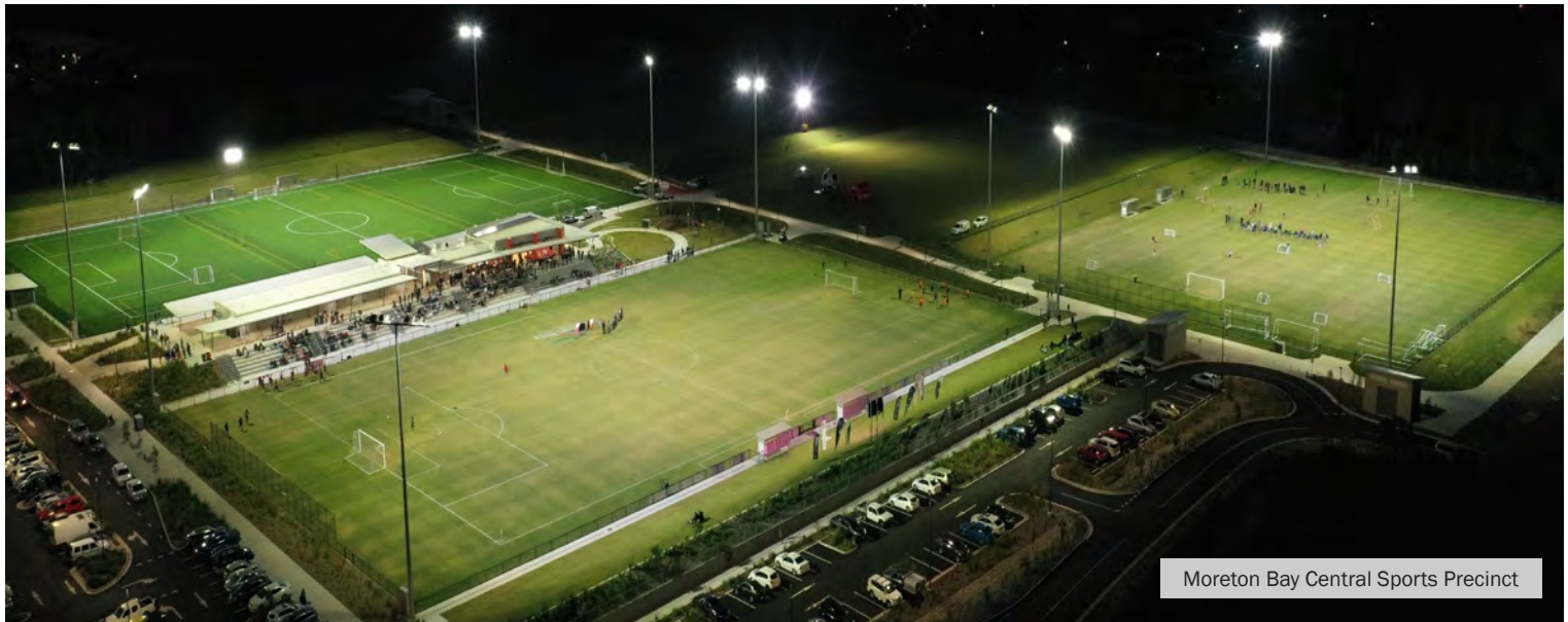
Moreton Bay Central Sports Precinct