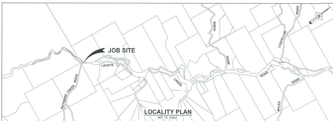
Figure 1: Locality plan - Laceys Creek Road, Laceys Creek

Works on site are scheduled to commence in March 2019 and be completed by June 2019 over a 14-week period, which includes an allowance for wet weather.