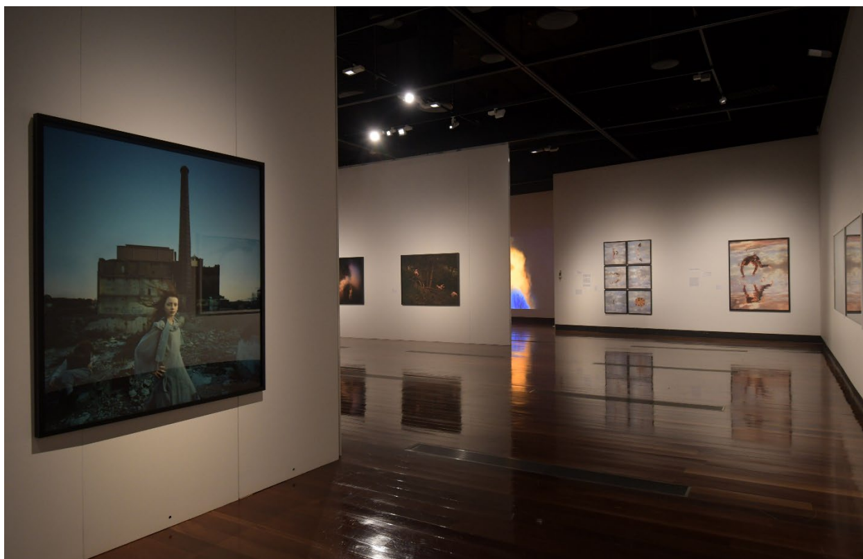
Inside Caboolture Art Gallery. Exhibition Tamara Dean | Leave only footprints .