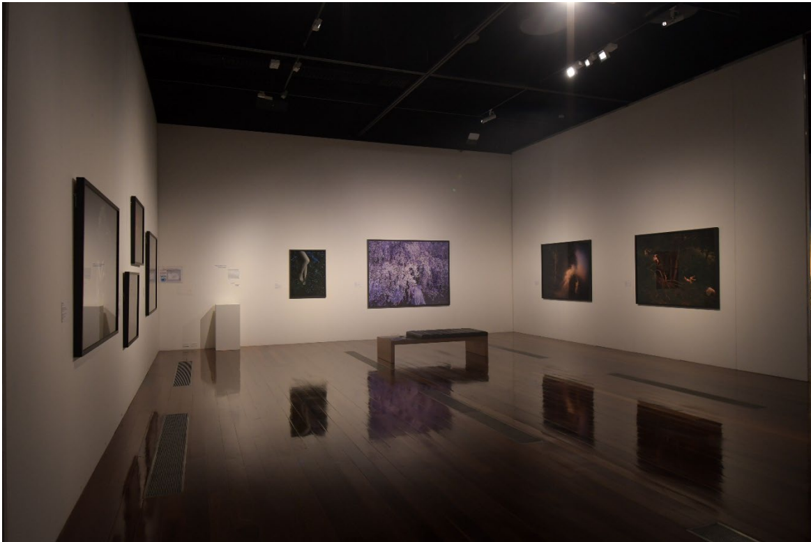
Exhibition Tamara Dean | Leave only footprints .

These are some photos of what the inside of the gallery looks like, so I can prepare before my visit.