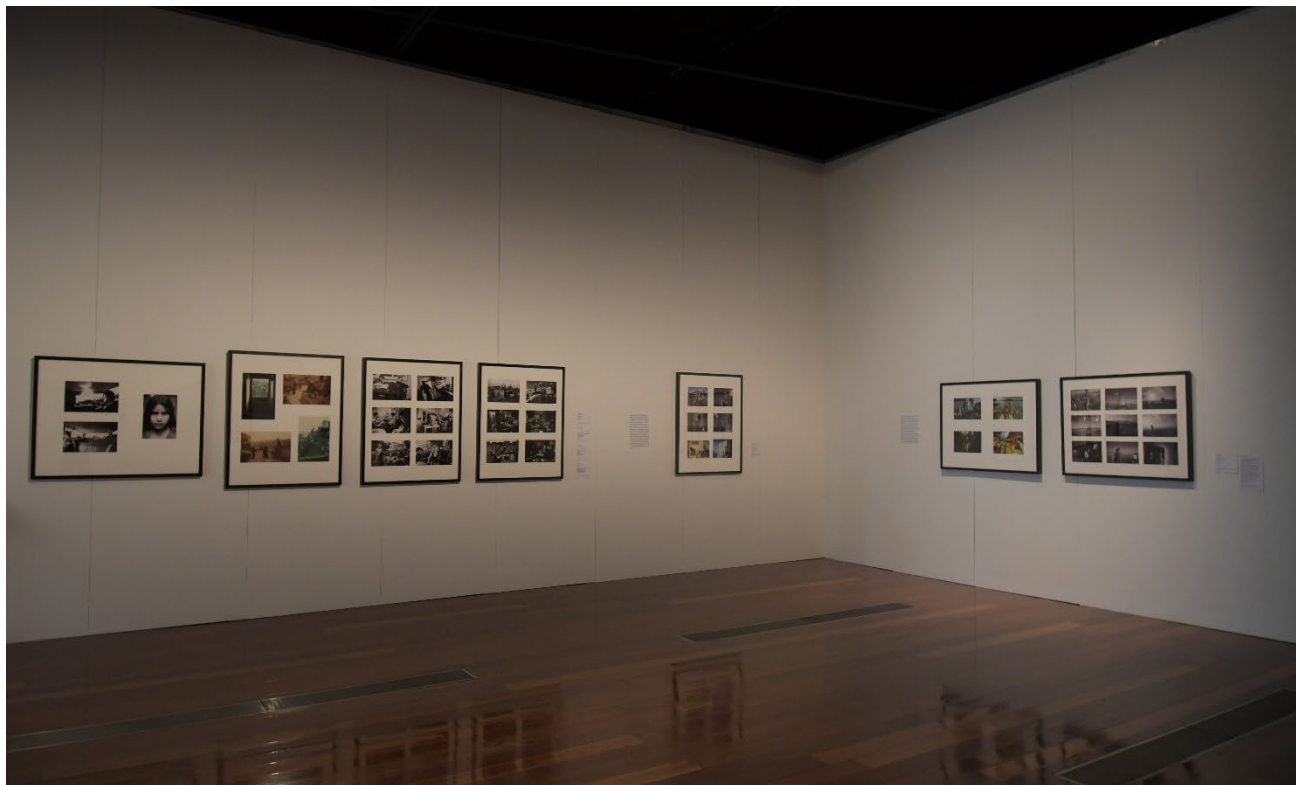
Exhibition Tamara Dean | Leave only footprints .

Through the gallery's glass sliding doors, I will find myself in a large exhibition space. The main gallery has one large exhibition space that changes layout for each exhibition. It is a big space with a wooden floor that looks like this.