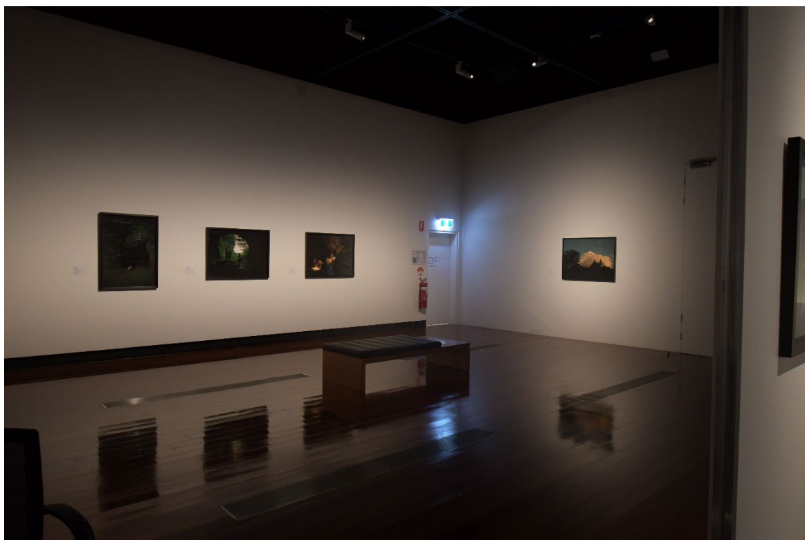
Exhibition Tamara Dean | Leave only footprints .